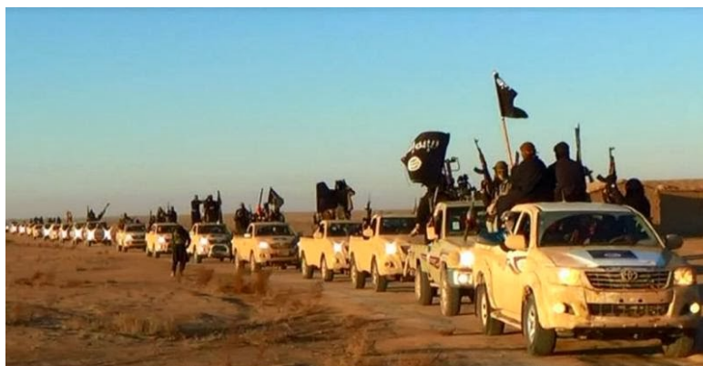
Image: ISIS has convoys of brand new matching Toyota's the same vehicles seen among admittedly NATO-armed terrorists operating everywhere from Libya to Syria, and now Iraq. It is a synthetic, state-sponsored regional mercenary expeditionary force.

A senior U.S. official said the intelligence collected under the small [secret US drone] program was shared with Iraqi forces, but added: "It's not like it did any good." The rapid territorial gains by the Islamist forces loyal to Islamic State of Iraq and al-Sham, or ISIS, an al Qaeda offshoot, caught the U.S. by surprise, the officials said.