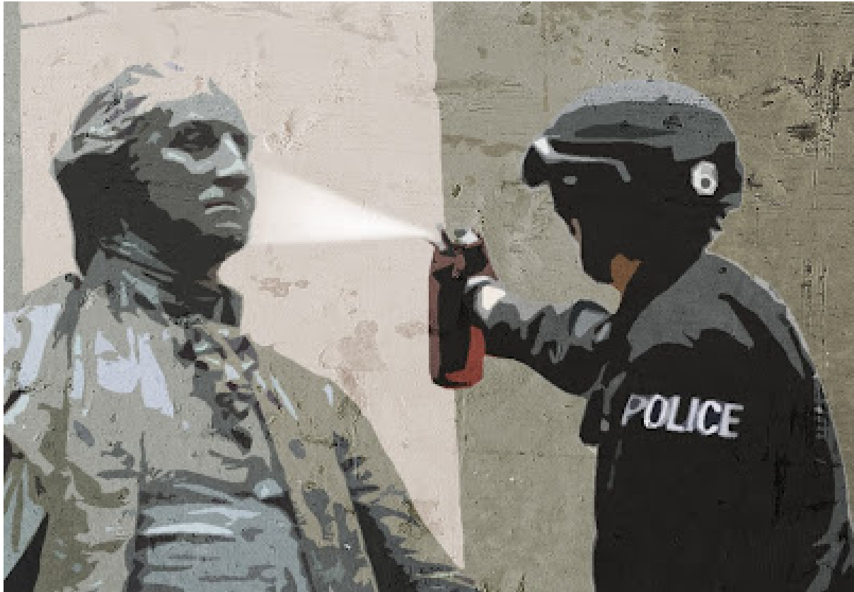
Painting by Anthony Freda: www.AnthonyFreda.com

However - as noted above - the austerity caused by redistribution of wealth to the super-elite is causing severe budget cuts to the courts, resulting in the wheels of justice slowing down considerably.