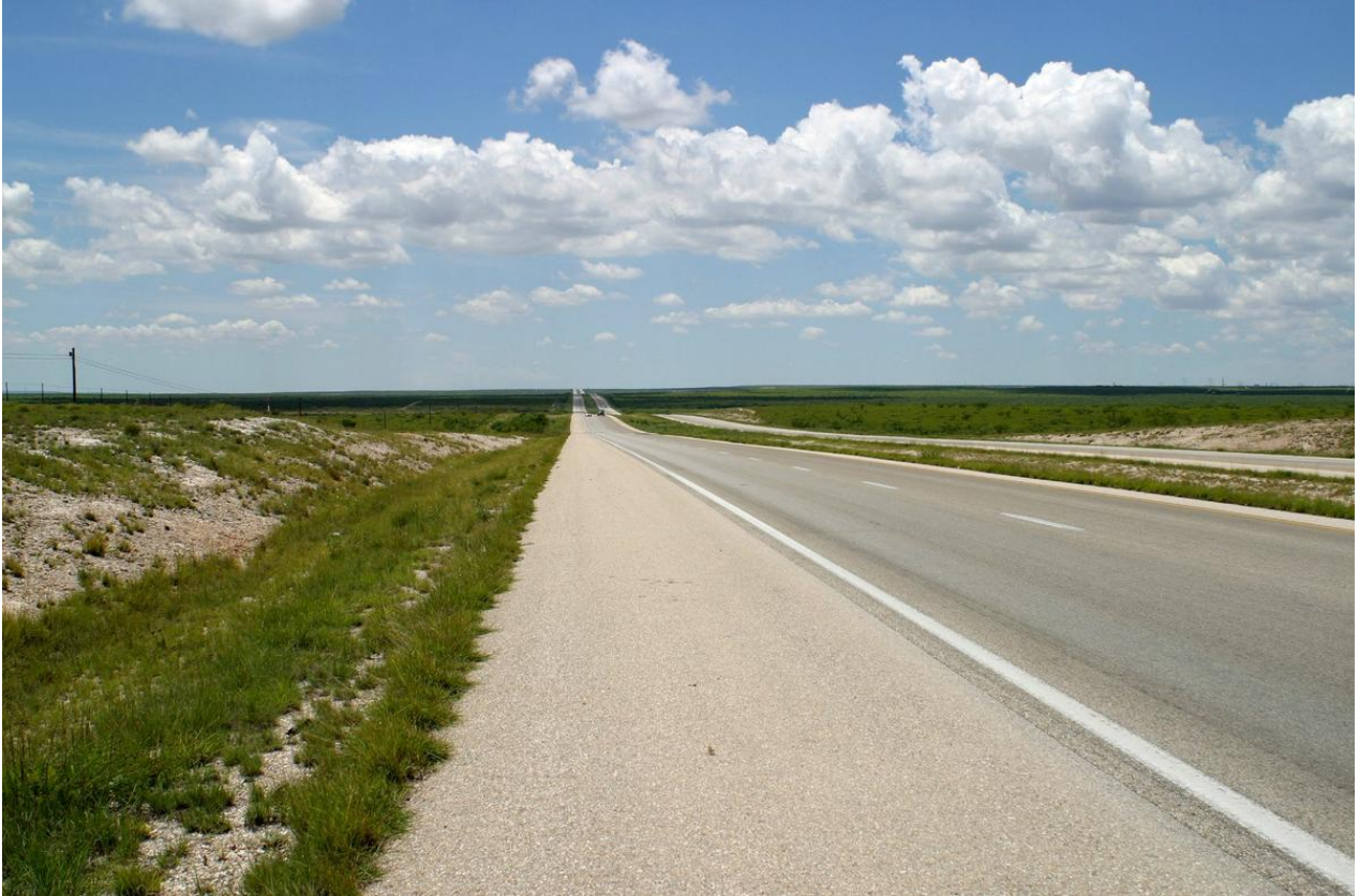
Route 62, east of Hobbs, New Mexico, the heart of America's "nuclear corridor."

Eastern New Mexico is no stranger to nuclear waste. To the south of Hobbs, the British nuclear fuel company, Urenco, runs a uranium enrichment facility. To the west, International Isotopes Inc. is hoping to establish a factory for depleted uranium processing. On the drive from Hobbs to Carlsbad, you pass the turnoff to the Waste Isolation Pilot Plant.