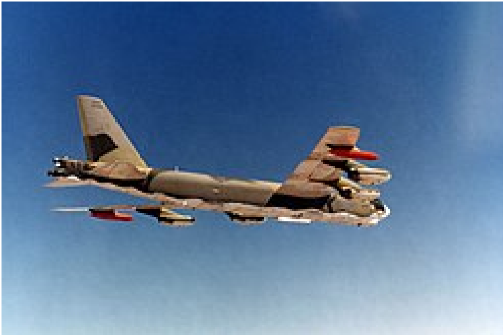
A B-52G, similar to the one that crashed at Thule Air Base.

not to be placed here during “peacetime,” which is still in effect since 1957 ( explained in part 1 ). Nevertheless, the U.S. had secretly placed atomic weapons on its Greenland colony . H.C. Hanssen, another Social Democrat, had secretly granted permission to the U.S. to place atomic bombs at Thule base on Greenland despite the 1957 nuclear free zone policy. A B-52G Stratofortress aircraft carrying four thermonuclear bombs crashed due to a human error, which caused a fire. Several hundred Danish and US American clean-up workers died from radiation poisoning causing cancer.