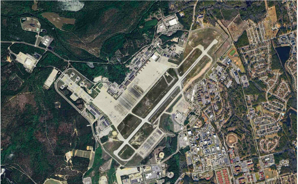
Aerial view of Pope Airfield in Fayetteville, North Carolina, where records have placed the covert US Air Force planes.