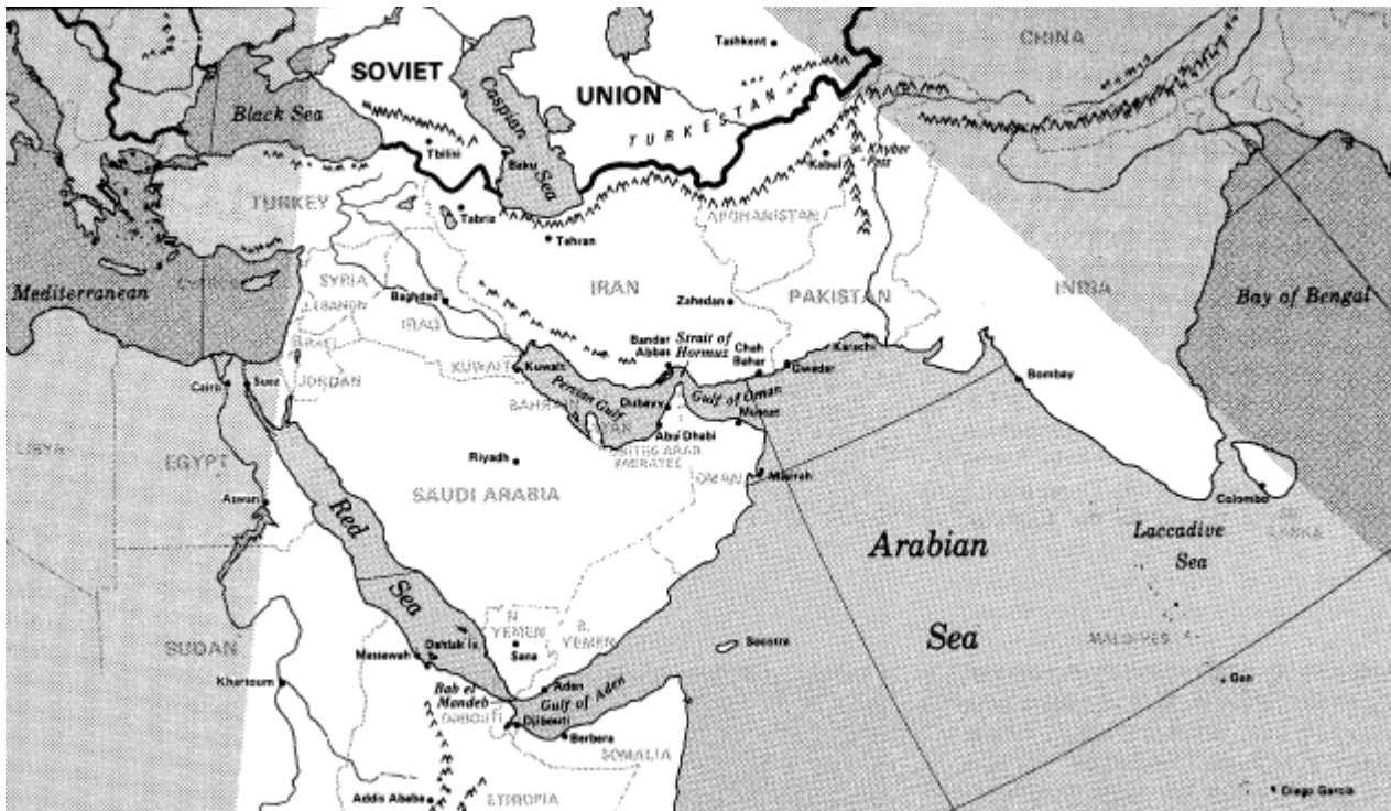
Map: The Indo-Arabian Region Also republished in 1988 under a different name: Southern Theater of Military Action © Michael K. McGwire, 1987.