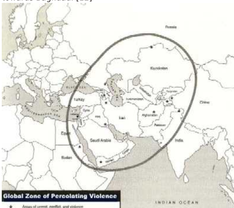
Map: Global Zone of Percolating Violence © Zbigniew K. Brzezinski, 1997.

During the bloody Iraq-Iran War, both sides were used to weaken one another. The intention was, quoting Henry Kissinger, to “let them [meaning Iraq and Iran] kill each other.” Thus, the U.S. tried to keep either side from winning and always in a military deadlock. According to a May 20, 1984 issue of Newsday , an American newspaper, the U.S. feared an Iranian victory and developed a contingency plan to militarily intervene on the side of Iraq by using the U.S. Air Force against Iran in a bombing campaign if the Iranians should advance towards Baghdad. [12]