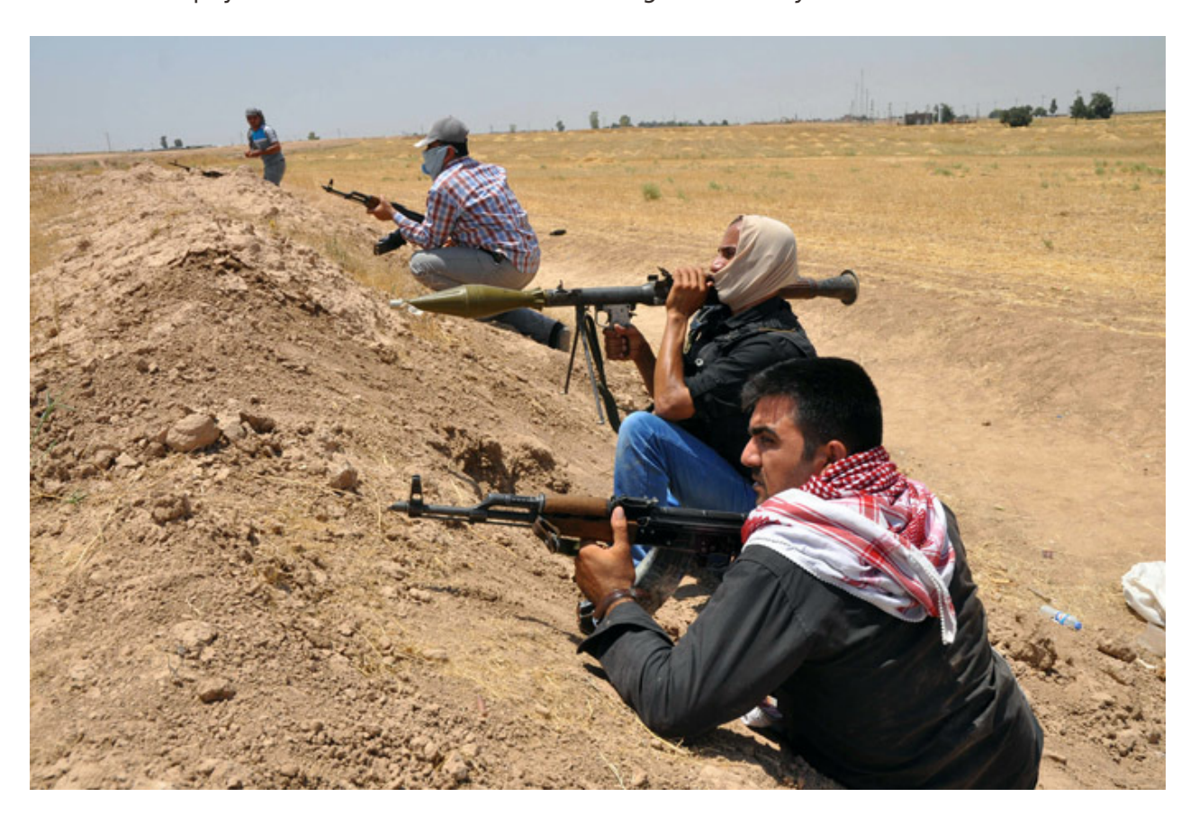
ABOVE PHOTO: Iraqi Turkmen fighters take part in an intensive security deployment in the town of Taza, south of the northern oil city of Kirkuk, June 19, 2014.

Warmongers like the British war criminal Tony Blair, the former prime minister of Britain who helped illegally invade and occupy Iraq in 2003, and Kenneth Roth, the executive director of Human Rights Watch that has demanded that a war on Syria be launched by the US government, even had the audacity to simultaneously claim on June 14, 2014 that the attack on Iraq by ISIS is the result of "not launching a war on Syria."