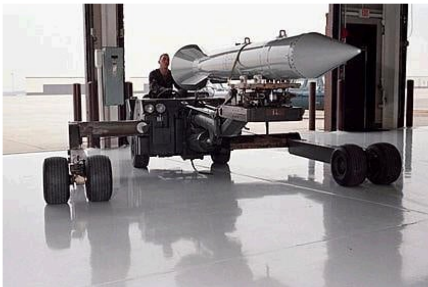
B61 Model 11 nuclear bomb at Whiteman Air force base

A JTA contains instrumentation and sensors that monitor the performance of numerous weapon components [e.g of the B61-11] during the flight test to determine if the weapon functions as designed. This JTA also included a flight recorder that stored the bomb performance data for the entire test. The data is used in a reliability model, developed by Sandia National Laboratories, to evaluate the reliability of the bomb. (Ibid)