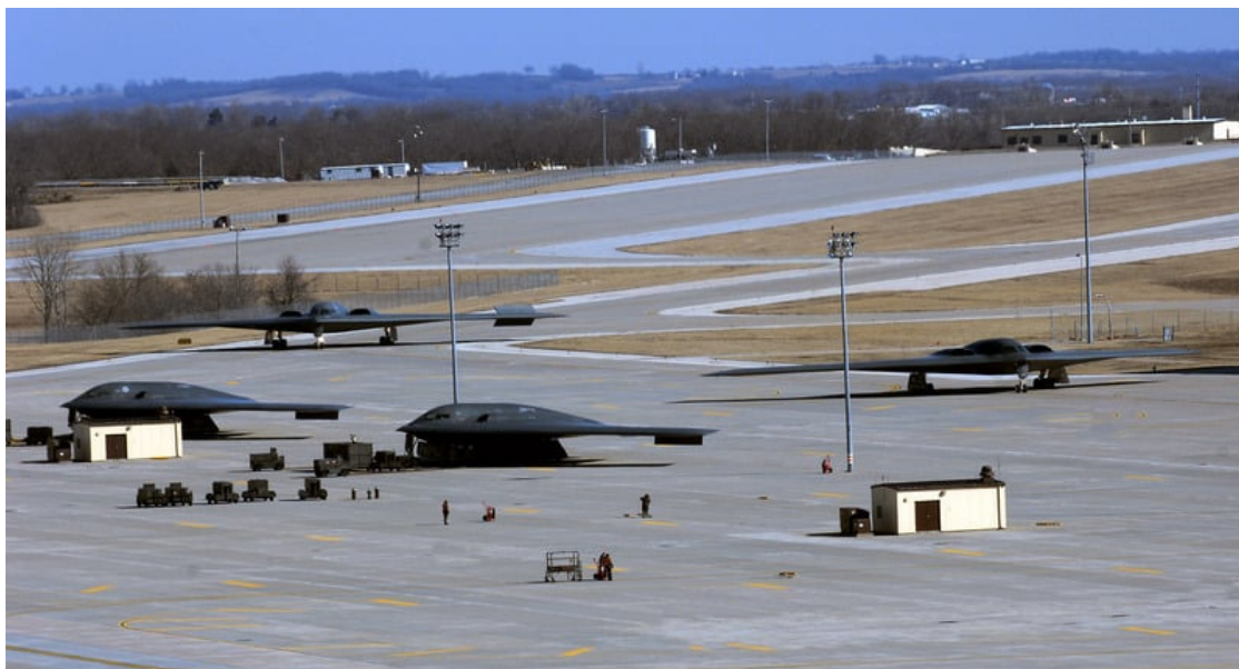
Whiteman Air Force Base

While we are not in a position to verify the accuracy of these reports, the 45 one-ton bombs correspond roughly to the B-2 specifications, namely each of these planes can carry sixteen 2,000 pound (900 kg) bombs.