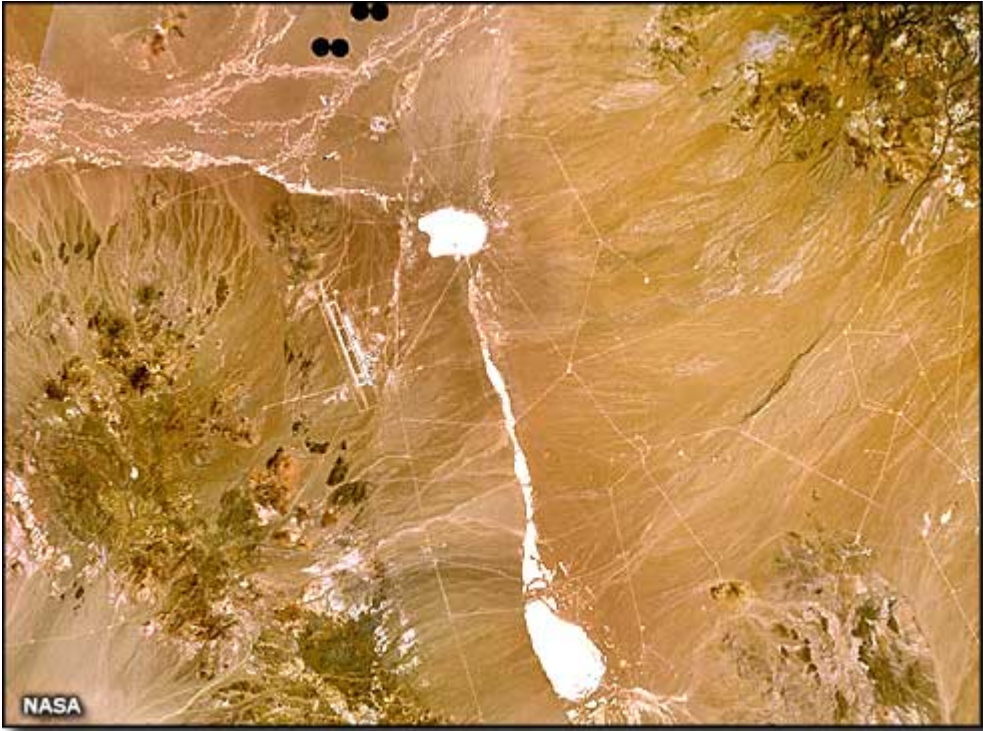
Aerial View of Tonopah Test Range where the B61 11 JTA was tested using a B-2 Spirit Stealth bomber.