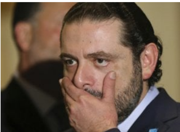
Lebanese Prime Minister Saad Hariri

These and other important regional set-backs have led to Zio-Neocons' rage and frustration. Most noticeable is the US-Israel-Saudi's increasingly frenzied actions all intended, in one way or another, to threaten, destabilize and destroy states and peoples resisting the ever-expanding US domination in the Middle East. These actions, in line with the PNAC's agenda, have included: