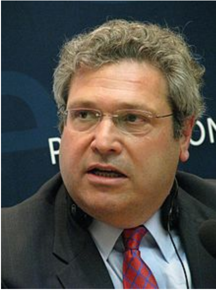
Robert Kagan

imperialist Iran having demonstrated its ability for almost two decades to defend its rights and independence in the face of continuous US attacks and conspiracies, and enjoying a fair level of regional influence and high potential to effectively challenge the US-Israel's unlawful and hostile acts in the region, became the obvious choice of a new 'enemy'.