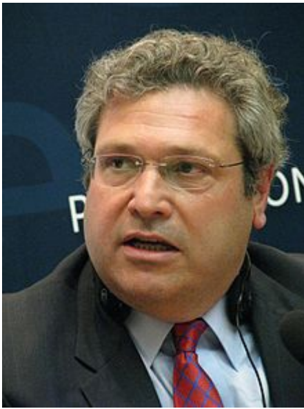
Robert Kagan

imperialist Iran having demonstrated its ability for almost two decades to defend its rights and independence in the face of continuous US attacks and conspiracies, and enjoying a fair level of regional influence and high potential to effectively challenge the US-Israel's unlawful and hostile acts in the region, became the obvious choice of a new 'enemy'.