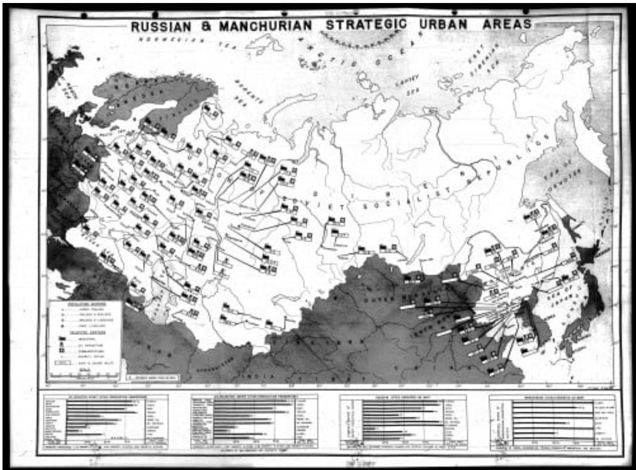
Map of 66 Soviet Urban Strategic Areas to be Bombed with 206 atomic Bombs (Declassified September 1945)

This diabolical project under the Manhattan Project was instrumental in triggering the Cold War and the nuclear arms race.