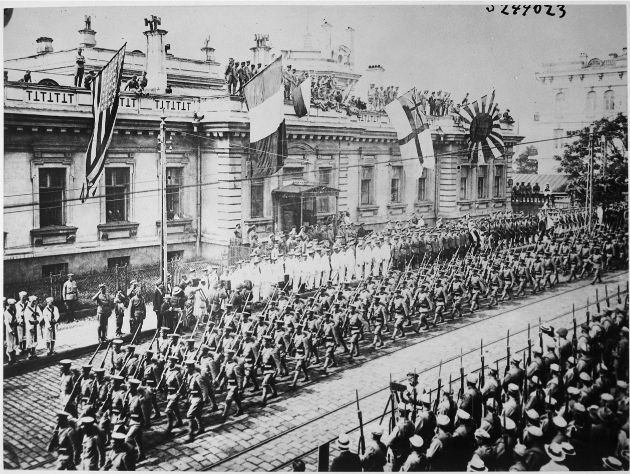
US and Allied Troops in Vladivostok in 1918