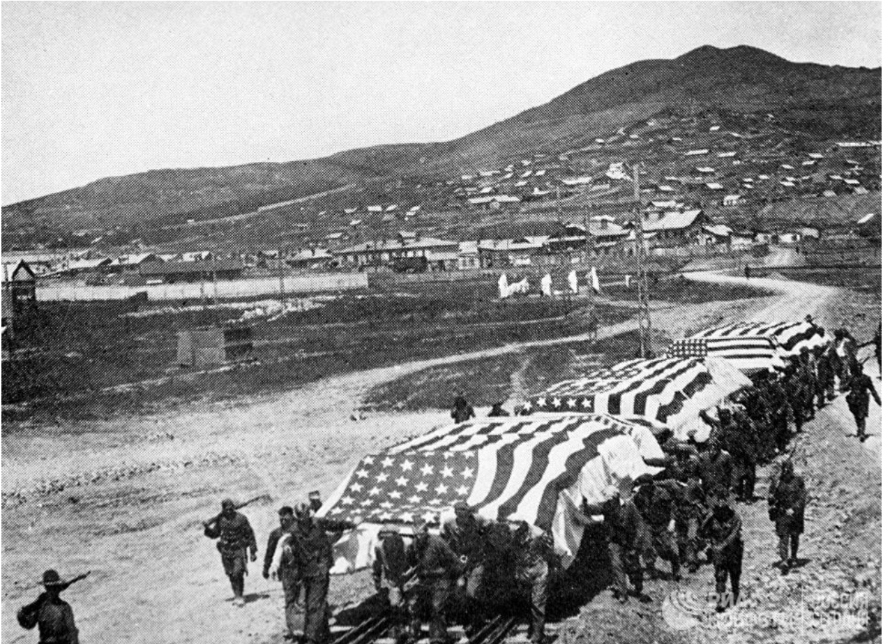
U.S Forces in Vladivostok, 1918