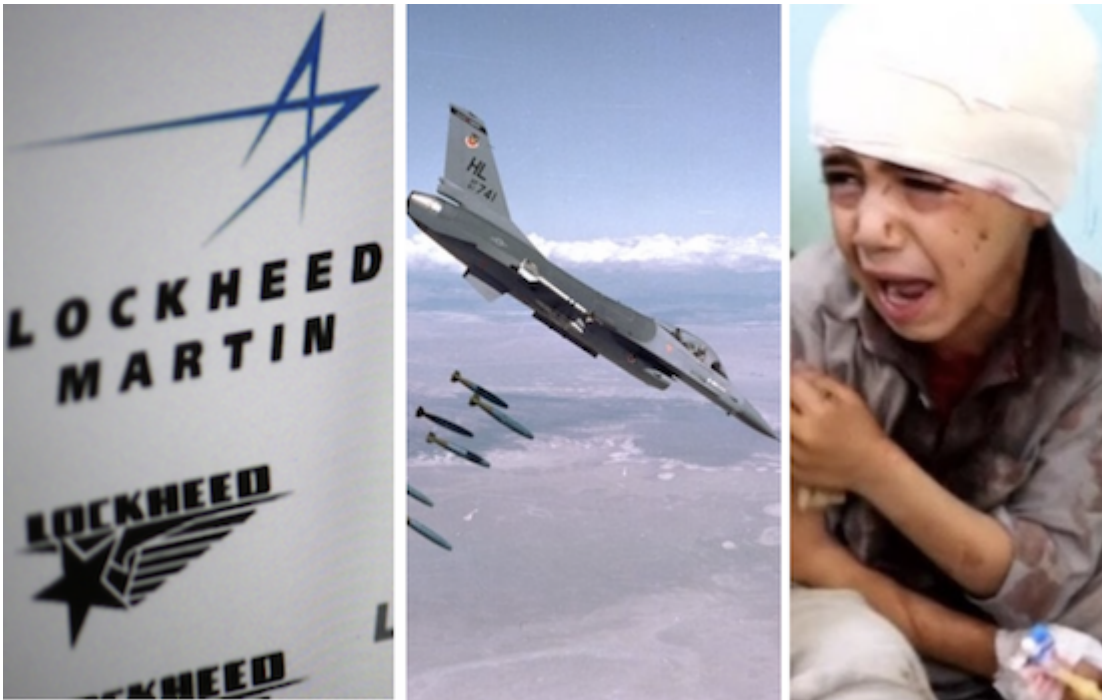
F-16 drops MK82 bombs; Child victim of attack in which MK82 bomb built by Lockheed Martin was dropped on his school bus Aug. 9, 2018.

It is more realistic to view U.S. economic and foreign policy in terms of the military-industrial complex, the oil and gas (and mining) complex, and the banking and real estate complex than in terms of the political policy of Republicans and Democrats. The key senators and congressional representatives do not represent their states and districts as much as the economic and financial interests of their major political campaign contributors. A Venn diagram would show that in today’s post-Citizens United world, U.S. politicians represent their campaign contributors, not voters. And these contributors fall basically into three main blocs.