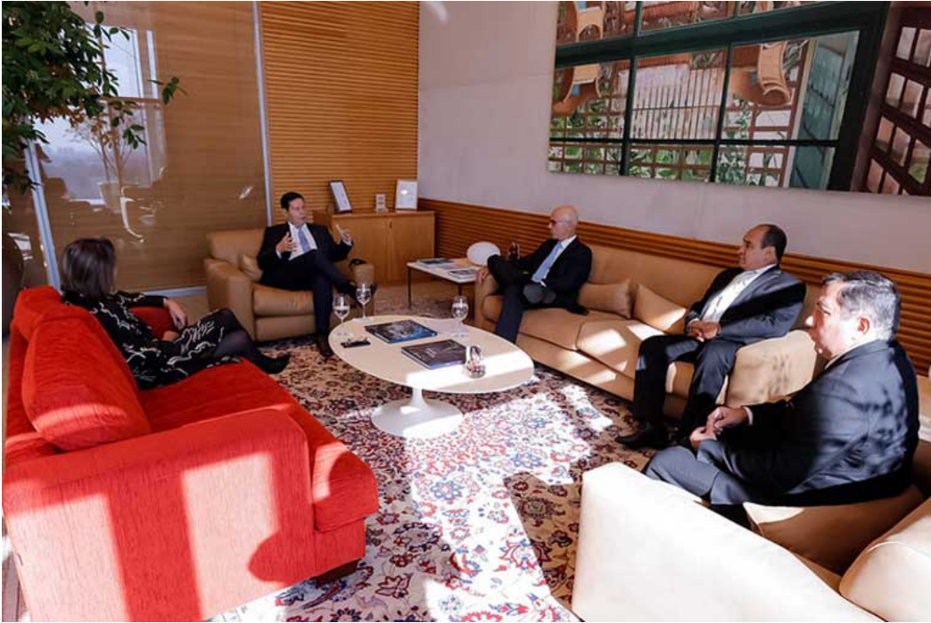
Meeting between Vice President Hamilton Mourão and members of the Committee and the Board of Directors of Santander Brasil Bank in Brasília. July 23, 2020.