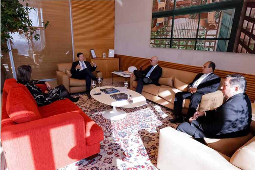
Meeting between Vice President Hamilton Mourão and members of the Committee and the Board of Directors of Santander Brasil Bank in Brasília. July 23, 2020.