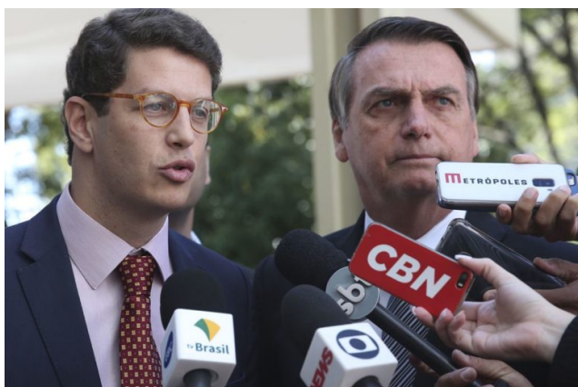
Image on the right: Environment Minister Ricardo Salles (left) with President Jair Bolsonaro.

So far, the Bolsonaro government seems little inclined to listen to critics. It has, however, been meeting with, and initially responding favorably, to some of those responsible for the Amazon's deforestation.