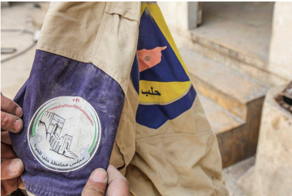
Emblem of a shadow council on White Helmet uniform