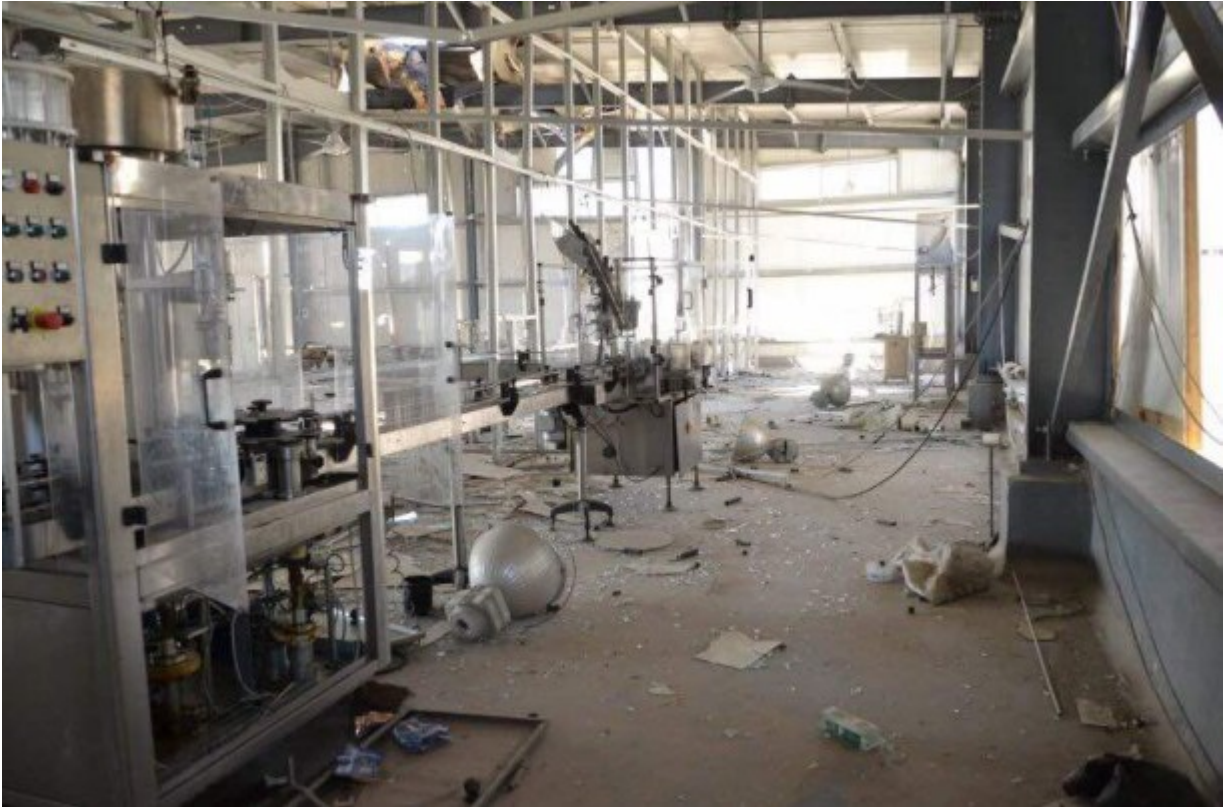
Ransacked and looted: one of thousands of factories taken over or destroyed by terrorists groups in Aleppo

Still, Shehabi is amazed at how western media professionals and politicians are still referring to terrorist factions as the ‘rebel opposition,’ or ‘moderate rebels.’ He then proceeded to show us his collection of photos of numerous radical militant leaders posing with various US officials. One after another, Shehabi delivered a damning indictment of western political leaders and their seemingly open affiliations with radical salafi terrorist commanders.