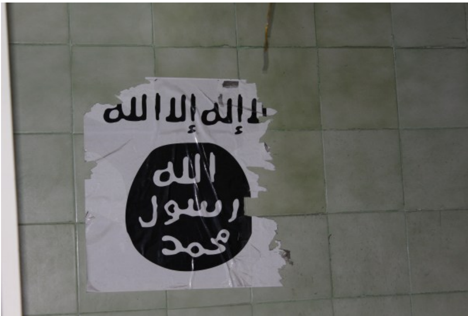
A cursory tour of the ruined Eye Hospital turned up endless ISIS and Al Nusra paraphernalia

When I looked at all the ISIS literature all over the ground, and all over the walls, I imagined the suffering of the people in this city, and then I remembered watching CNN's very own CFR mouthpiece, Fareed Zakaria, only last month, with one of his many 'Syrian opposition' guests, a woman who looked into the camera and claimed that Al Nusra and ISIS were never in Aleppo as she waxed on about 'the revolution.' Of course, Zakaria had no clue, which seems to be par for the course at the Pentagon's premier propaganda mill.