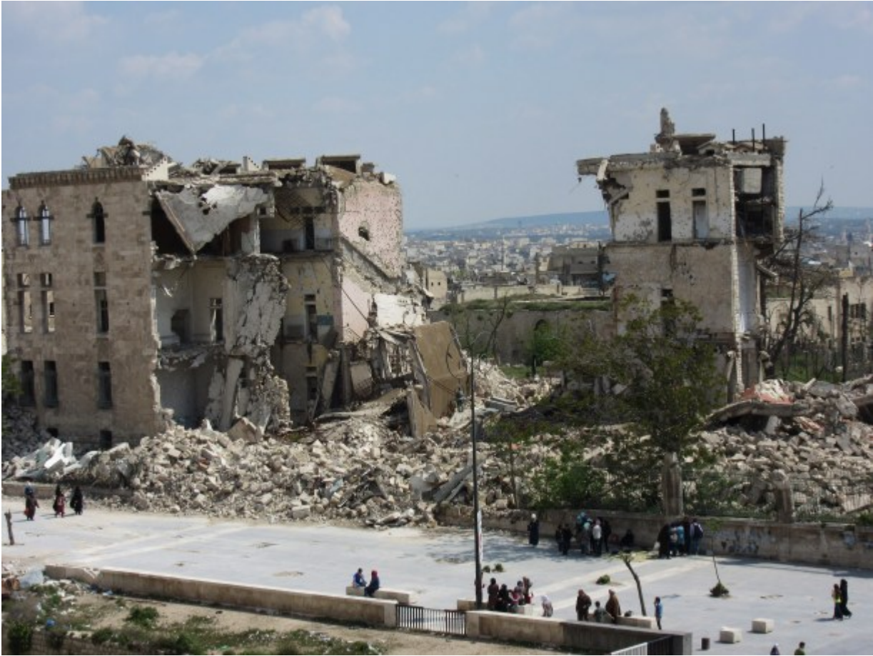
A view looking down from the steps of Aleppo's 13th century Old Citadel, at what is left of the site where the Ritz Carlton Hotel once stood

Before the war, the Ritz Carlton Hotel in Aleppo was arguably one of the most impressive boutique hotels in the world with a position and view which was second to none. The stately home turned hotel was part of the UNESCO World Heritage Site.