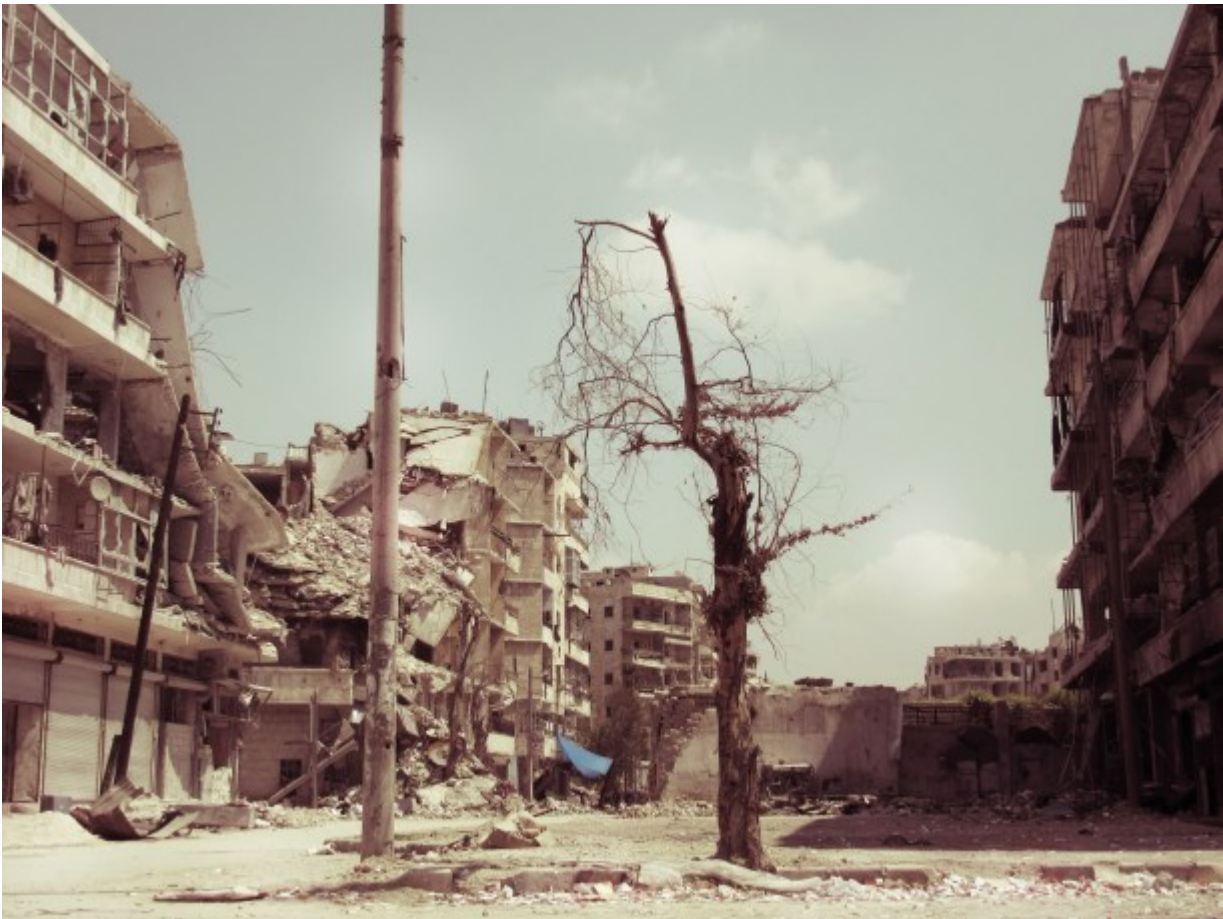
The last tree standing following severe damage near the front lines in Shaar, in East Aleppo