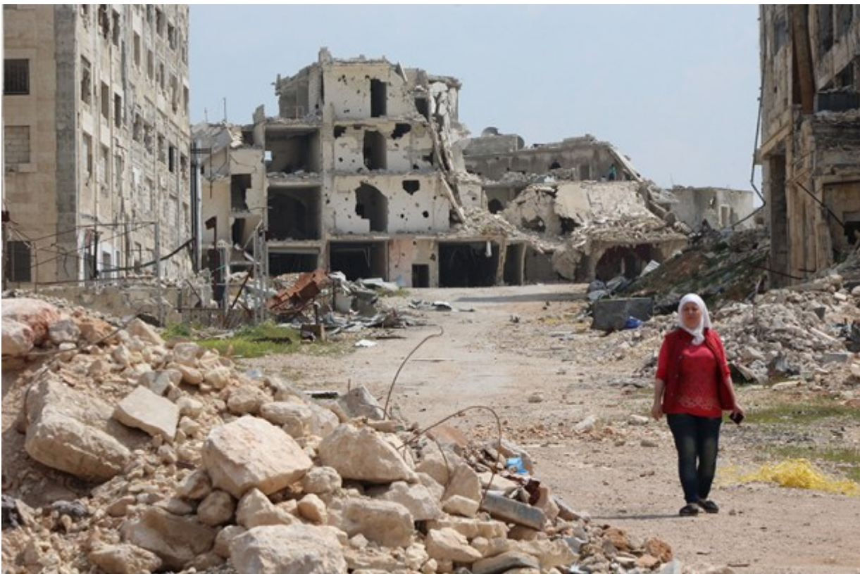
Layramoun district was home to the infamous Brigade 16 of the Free Syrian Army

In actuality, extensive damage in the heavy fighting areas around Aleppo was the result of artillery, tank ordinances and heavy gun fire from both sides, and from terrorist gas canister ‘Hell Canons’, rockets and bombing. Unlike the terrorist barrages which were fired randomly into civilian areas, Syrian air strikes were targeted, as were later Russian strikes. This fact is fairly self evident after touring the battle zone.