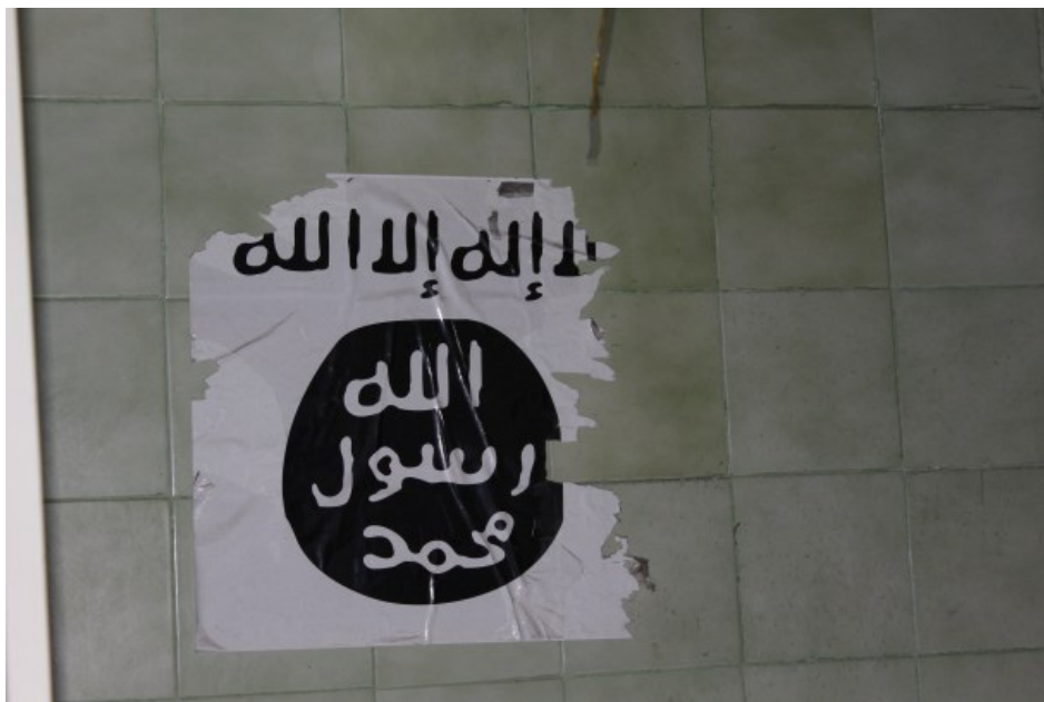
A cursory tour of the ruined Eye Hospital turned up endless ISIS and Al Nusra paraphernalia

When I looked at all the ISIS literature all over the ground, and all over the walls, I imagined the suffering of the people in this city, and then I remembered watching CNN's very own CFR mouthpiece, Fareed Zakaria , only last month, with one of his many 'Syrian opposition' guests, a woman who looked into the camera and claimed that Al Nusra and ISIS were never in Aleppo as she waxed on about 'the revolution.' Of course, Zakaria had no clue, which seems to be par for the course at the Pentagon's premier propaganda mill.