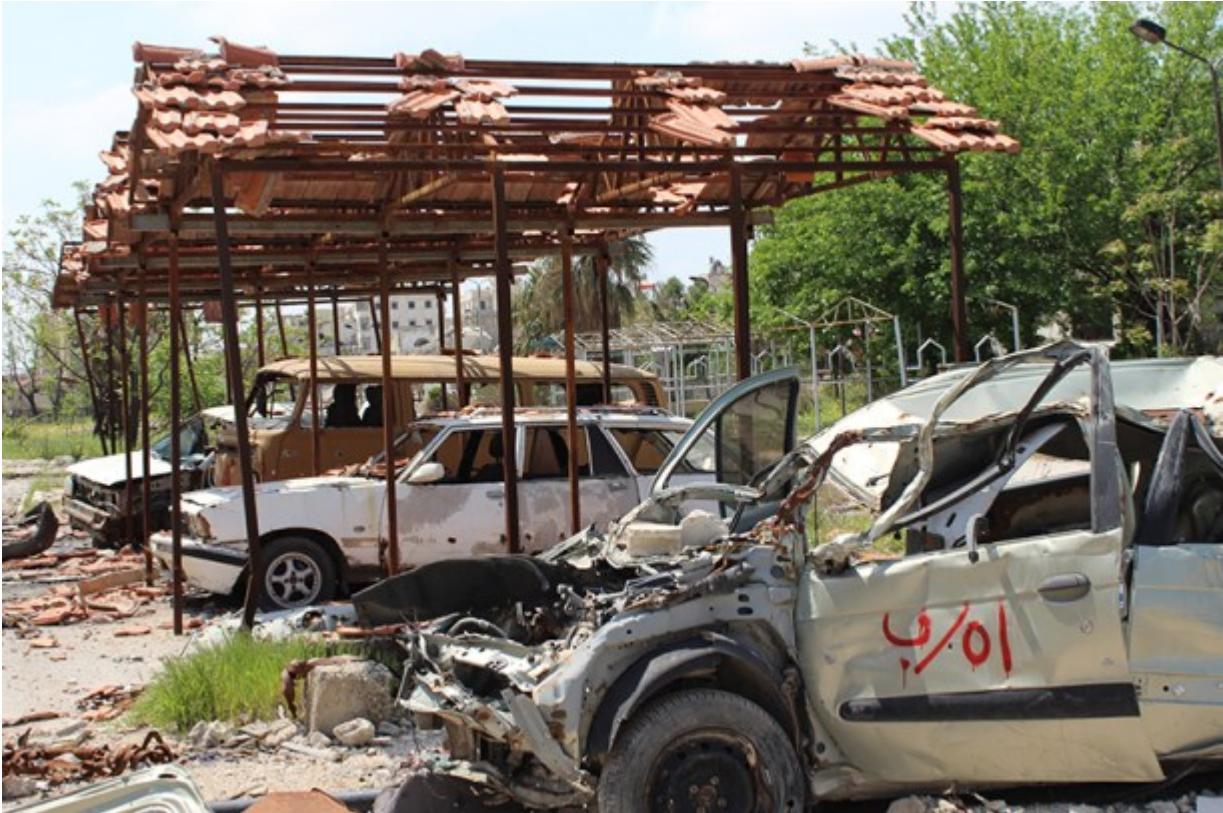
Destroyed vehicles parked outside the Eye hospital