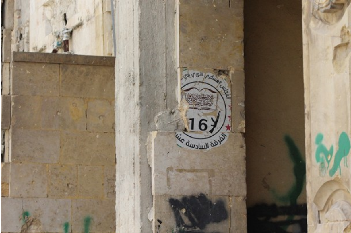
Brigade 16 commandeered factory in textile district to produce gas canister bombs

Driving into the the city from the east, we passed the Jibrin Refugee Centre where thousands of Aleppo displaced residents are still housed, along with newly arrived survivors of last week's car bomb attack at Rashideen outside of Aleppo, where at least 126 people were killed. The buses were transporting residents who were being evacuated from the towns of Foua and Kefraya, both under terrorist siege for the last two years. The violent event was a stark reminder of just how vicious this war continues to be, and that the ones who suffer the most are not governments, but the poorest of the people.