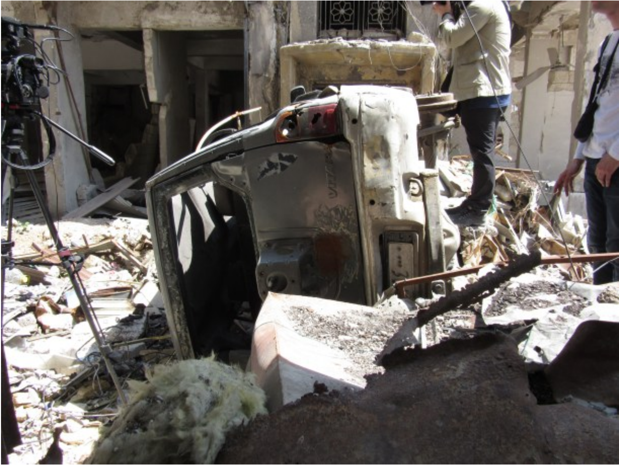
A blocked off alley way in Shaar, piled high with debris.