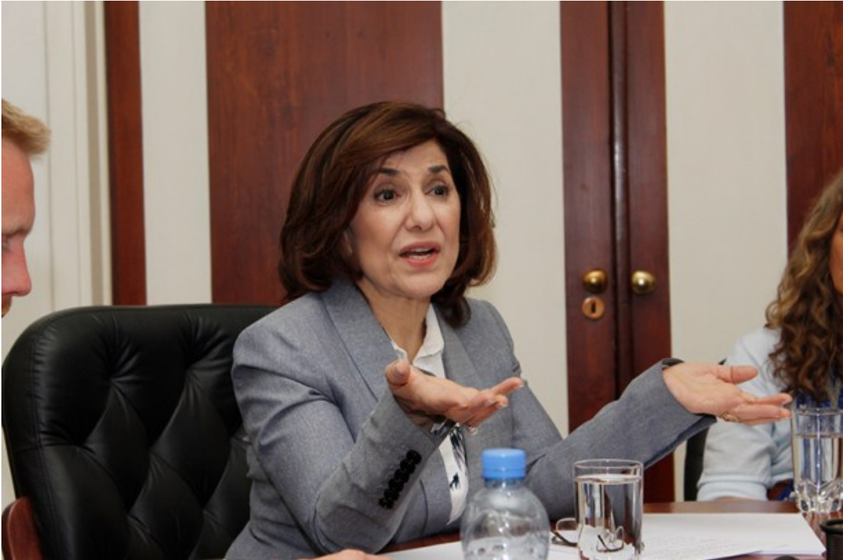
Dr Bouthaina Shaaban

The bombed-out property took on a whole new meaning after a later conversation we had with Dr Bouthaina Shaaban, Syria's chief political and media adviser to the President, who recalled a harrowing tale of her last encounter with the Turkish leader Erdogan right before the war began in 2011: