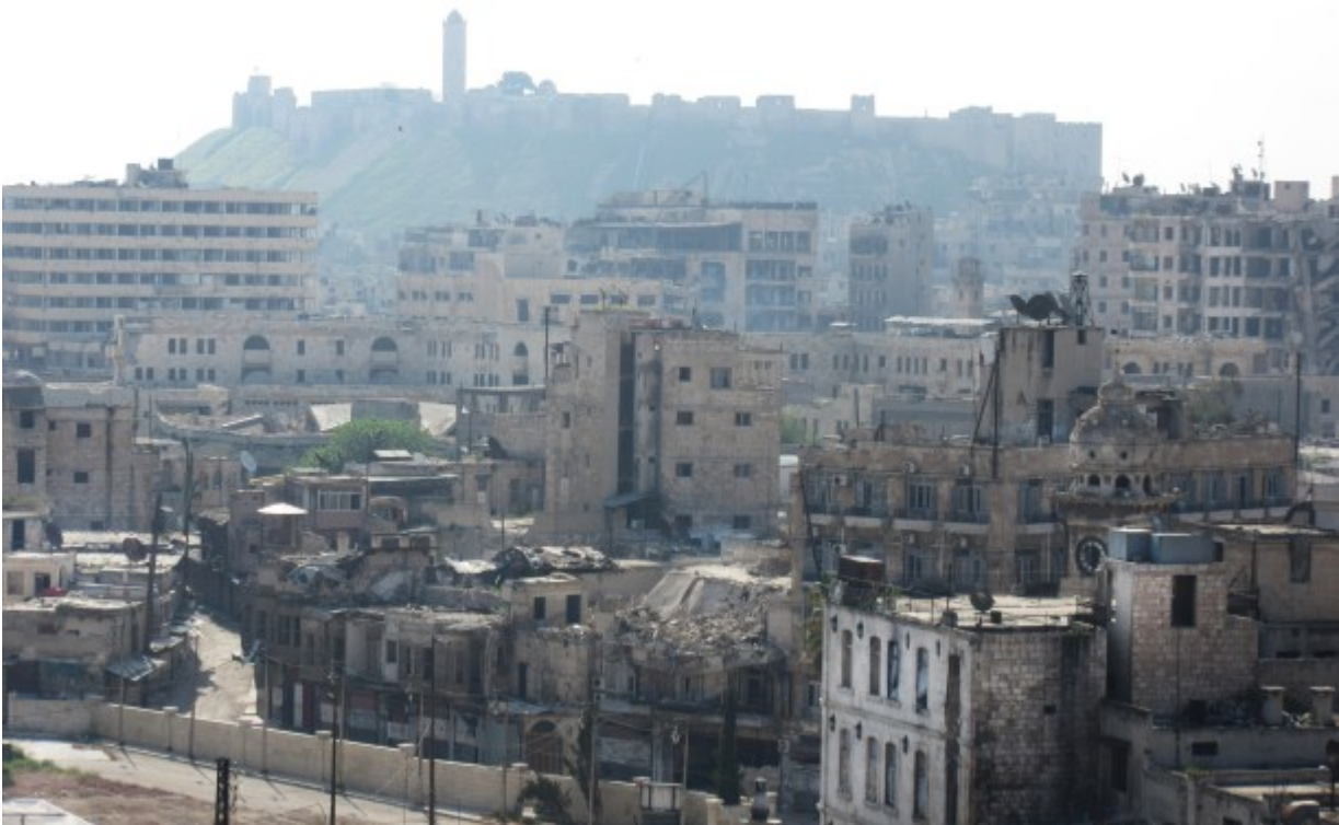
After heavy fighting, the Old Citadel remains in tact

"It started in Lebanon, continued to Iraq, continued to Palestine, then to Syria, and also Yemen. Yemen is the source of civilization to Saudi and to the Arab peninsula. Why? It seems that someone wants to destroy our culture - our civilization."