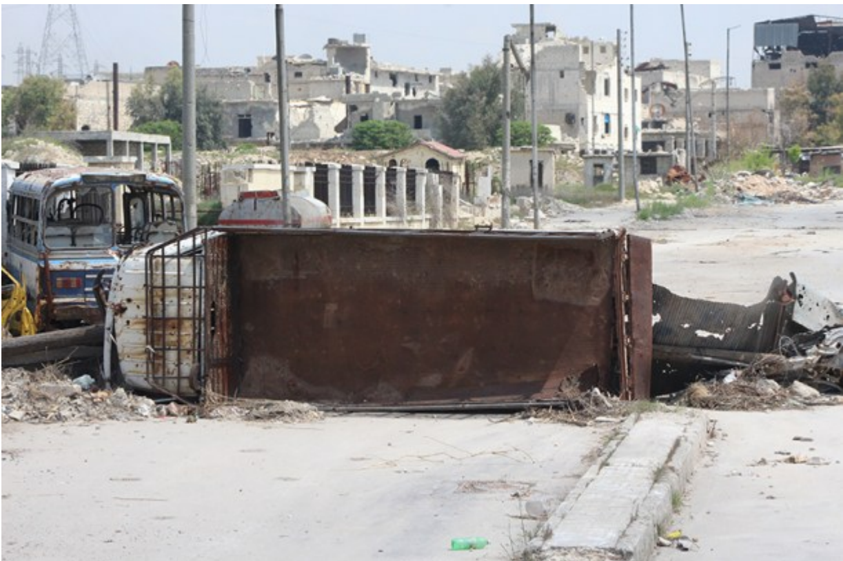
East Aleppo barricade

According to our guide and a number of other residents we spoke to, the vast majority of