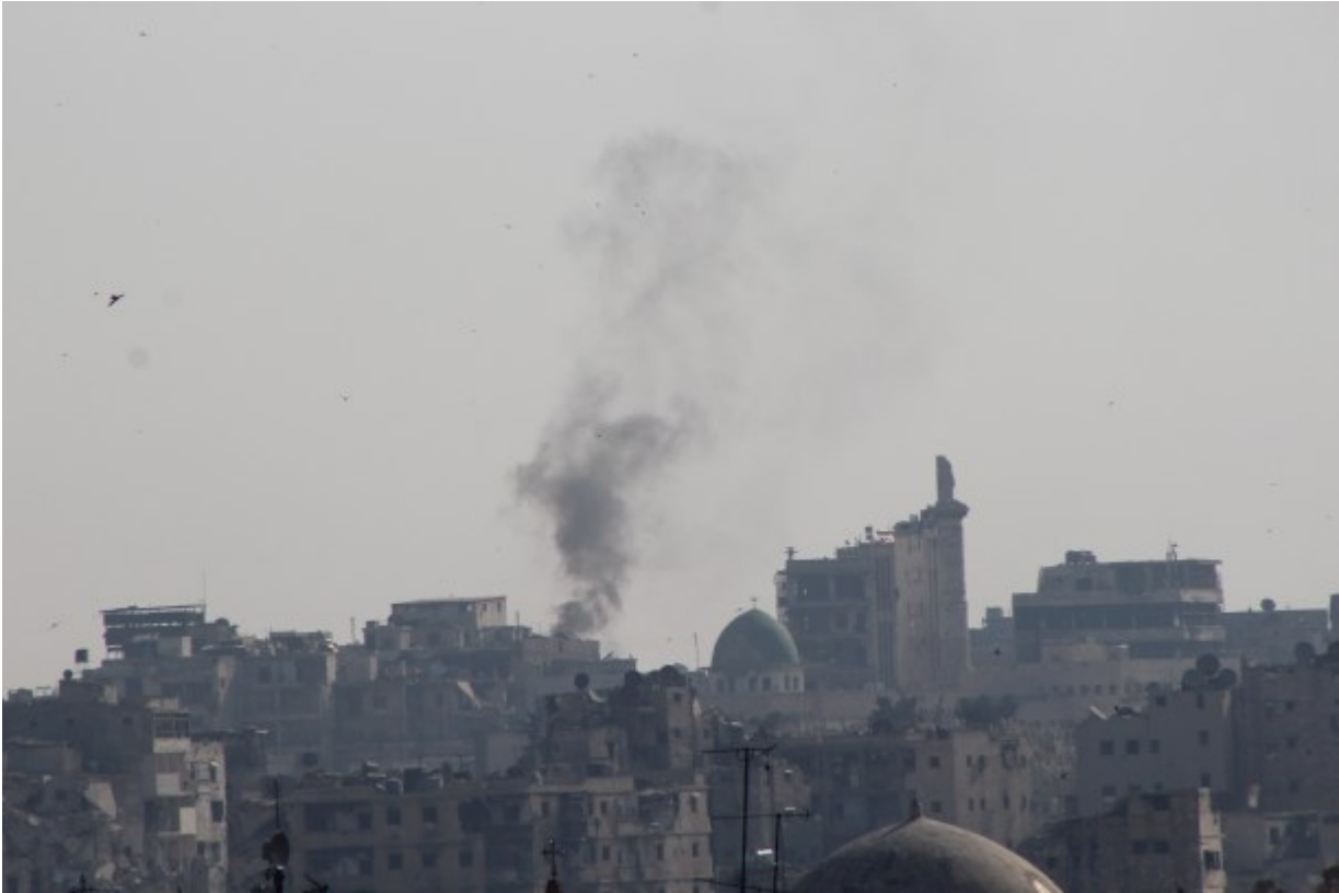
From our rooftop in the morning, you could see smoke bellowing up in the distance on the outskirts of Aleppo's city centre

Syrian and Russian airforce jets were buzzing over our heads while we were doing a walkthrough of the devastation in East Aleppo. I couldn't determine whether or not that strike was a terrorist mortar or a retaliatory airstrike by Syrian or Russian forces. It was one of many we could hear and see during our visit.