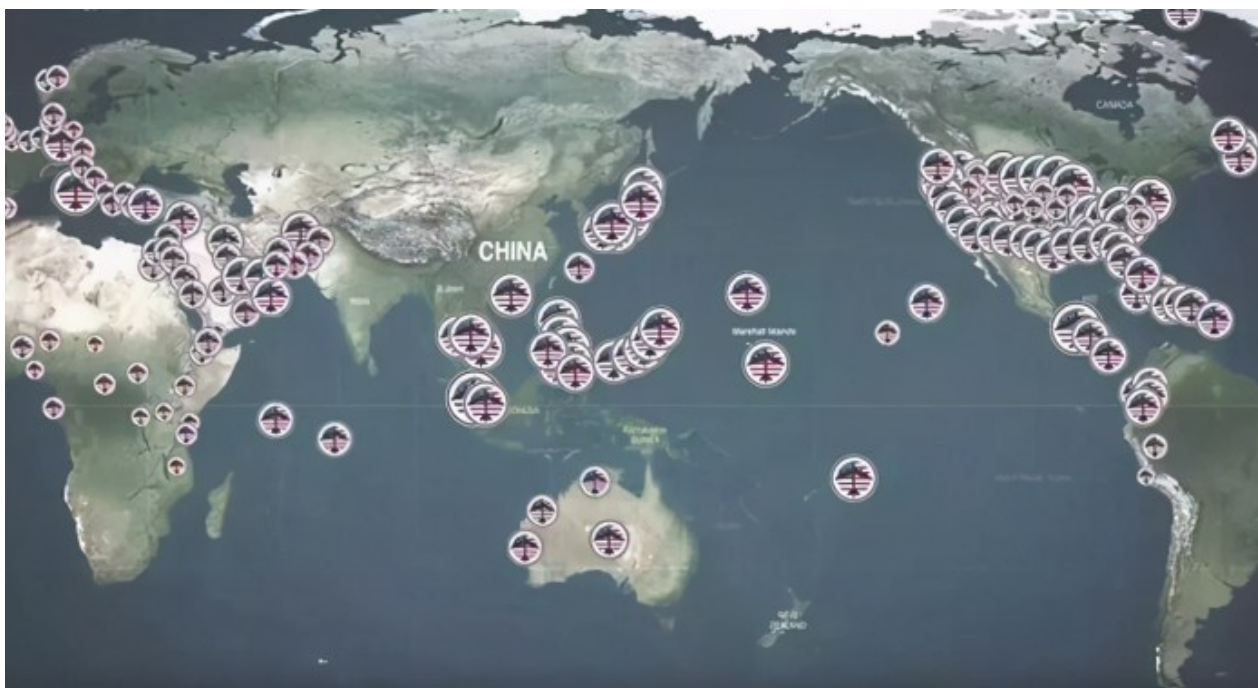
U.S. military bases around China, and world.

Yet the West is directly threatening China. The United States and the United Kingdom have 290 military bases encircling China and the U.S. is threatening with a nuclear “ first-strike capability .” The military budget of NATO is $1.2 trillion, six times that of China. So who is actually threatening whom here?