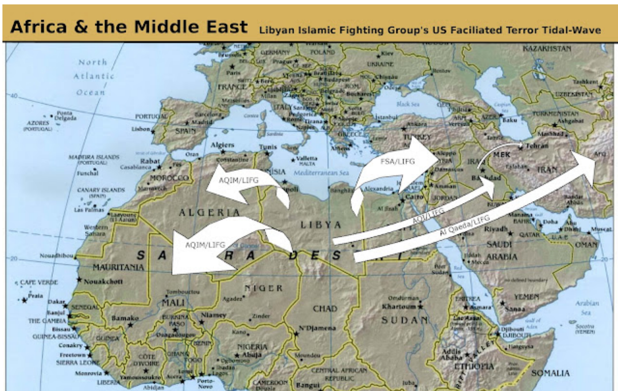
Image: NATO's intervention in Libya has resurrected listed-terrorist organization and Al Qaeda affiliate, LIFG. It had previously fought in Iraq and Afghanistan, and now has fighters, cash and weapons, all courtesy of NATO, spreading as far west as Mali, and as far east as Syria. The feared "global Caliphate" Neo-Cons have been scaring Western children with for a decade is now taking shape via US-Saudi, Israeli, and Qatari machinations, not "Islam." In fact, real Muslims have paid the highest price in fighting this real "war against Western-funded terrorism."