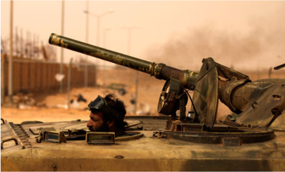
Image: Libyan terrorist manning a tank during NATO's 2011 overthrow of the Libyan government. The media expects the public to believe placard waving peaceful demonstrators had somehow, in just days, transitioned into tank driving, jet flying rebel forces – just like in Hollywood.