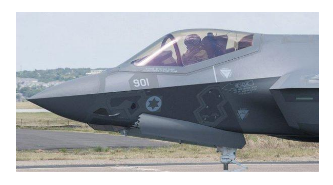
The F-35 is expected to replace aging airframes such as the F-15, F-16, and A-10. The

The F-35's deployment comes one month after Rockwell B-1 Lancer bombers completed their deployment at Al Udeid Air Base in Qatar, which left an operational gap of planes in the Middle East. The F-35s will support regional allies in airstrikes against the Taliban and Islamic State in Afghanistan.