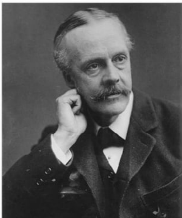
Arthur James Balfour (1848-1930)