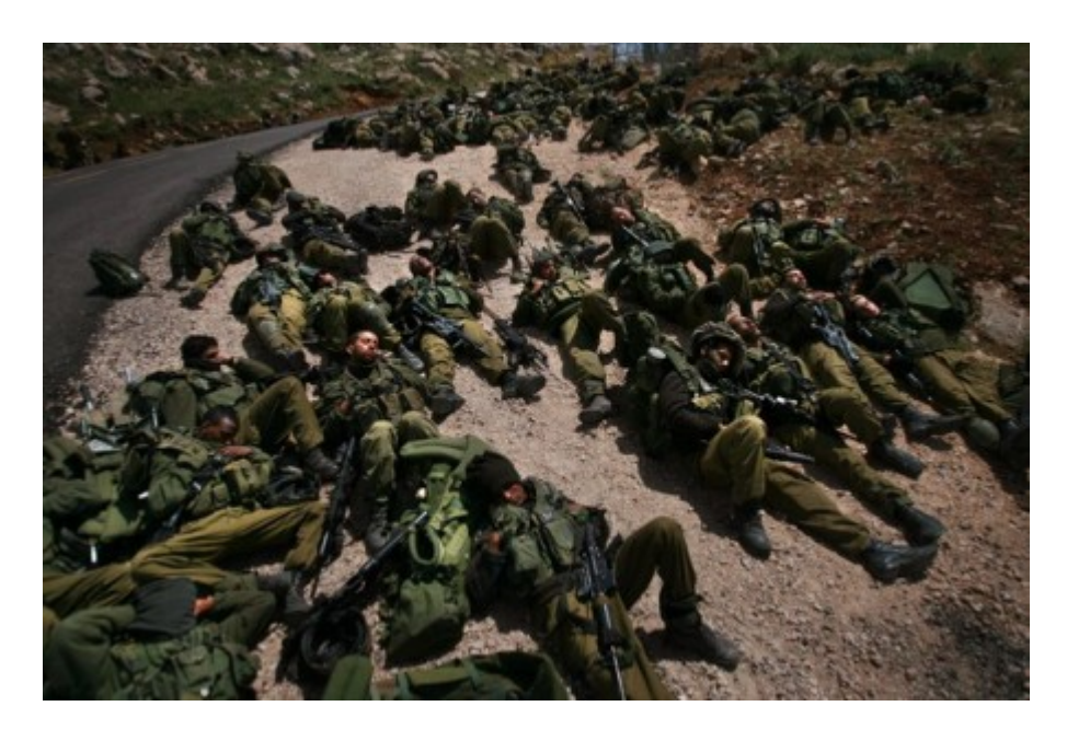
Israel has its sights set on the Golan Heights and South Lebanon.

Unlike Saddam Hussein in Iraq, or Gaddafi in Libya, President Assad's confidence in Syria's ability to overcome the current western-backed coup is not misplaced optimism. Unlike other soft targets in the surrounding region, Syria maintains one of the largest, most loyal, and well-trained standing armies and air force operations in the region. They have state-of-the-art anti-aircraft defense systems in place, and a very sophisticated and well-oiled intelligence network, one which has given its near neighbor and traditional adversary, Israel, a very difficult time penetrating over the decades.