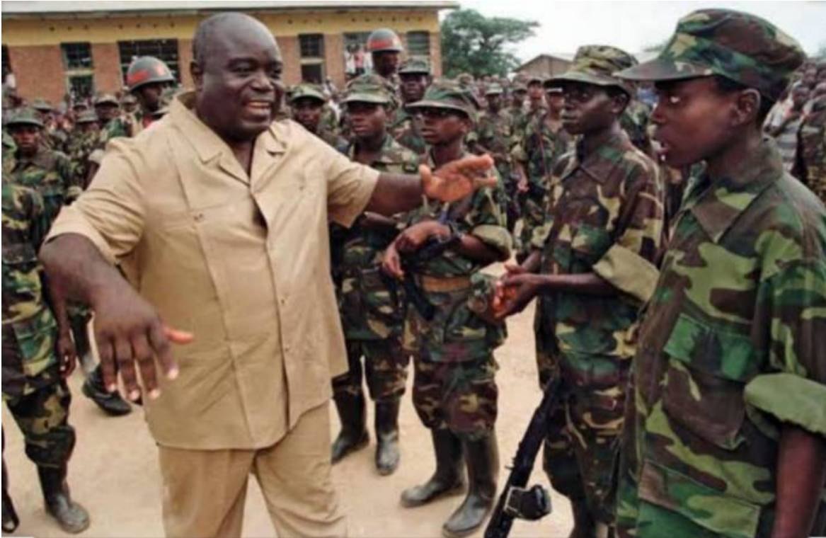
The late Laurent Kabila.

It is a wonder if this tactic was not also used when Huey Newton was assassinated exactly one year after he held a press conference from jail stating he refused release unless Geronimo Ji Jaga was released. [33] Tupac, who idolized Newton , was shot at by strangers in front of passive police exactly three years from the date of Newton's assassination. [34]