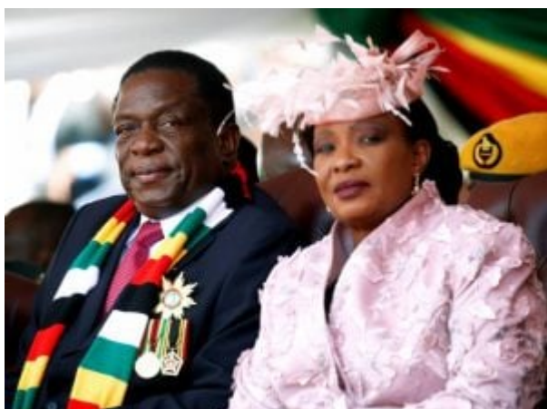
Image below: Zimbabwe President Emmerson Mnangagwa and First Lady Auxilia at his inauguration after winning the July 30, 2018 national election.

Many lessons can be learned from neighboring Zimbabwe where after over one year of the presidency of Emmerson Mnangagwa , Harare is still under the sanctions regime established by London and Washington, a blockade which has lasted for two decades. The