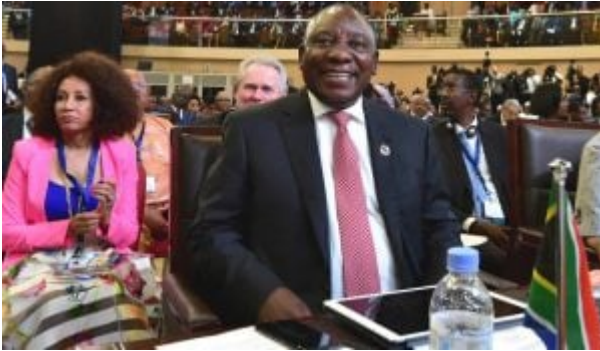
Image on the right: South African President Cyril Ramaphosa and Foreign Minister Lindiwe Sisulu at AfCFTA in Kigali, Rwanda, March 20-21, 2018

President Cyril Ramaphosa inherited a South African economy which is facing recession due to high unemployment, declining export earnings and the uncertainty among multi-national corporations over the intensifying debate surrounding proposals for a radical land redistribution program. Elections could take place in South Africa, the continent's most industrialized state, within less than four months where the ruling African National Congress (ANC) will once again seek to remain the majority party.