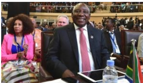
Image on the right: South African President Cyril Ramaphosa and Foreign Minister Lindiwe Sisulu at AfCFTA in Kigali, Rwanda, March 20-21, 2018

President Cyril Ramaphosa inherited a South African economy which is facing recession due to high unemployment, declining export earnings and the uncertainty among multinational corporations over the intensifying debate surrounding proposals for a radical land redistribution program. Elections could take place in South Africa, the continent's most industrialized state, within less than four months where the ruling African National Congress (ANC) will once again seek to remain the majority party.