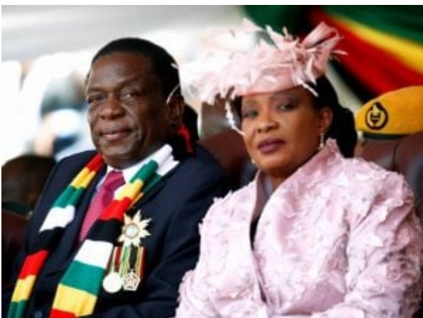
Image below: Zimbabwe President Emmerson Mnangagwa and First Lady Auxilia at his inauguration after winning the July 30, 2018 national election.

Many lessons can be learned from neighboring Zimbabwe where after over one year of the presidency of Emmerson Mnangagwa, Harare is still under the sanctions regime established by London and Washington, a blockade which has lasted for two decades. The Zimbabwe