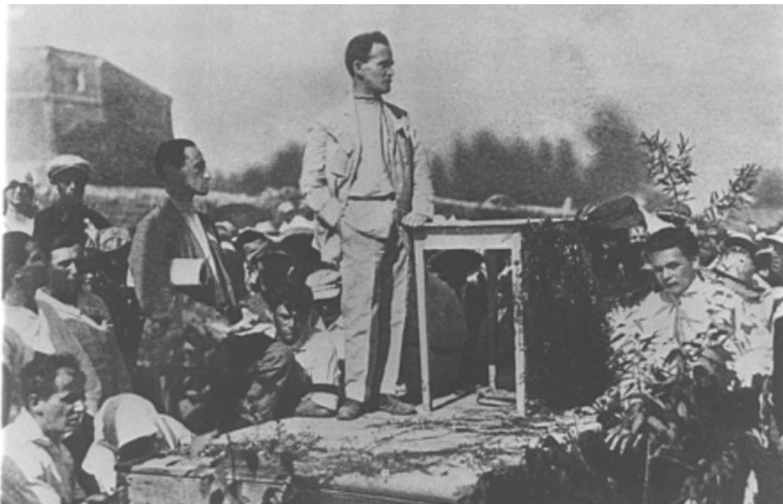
David Ben-Gurion addresses Histadrut members in 1924.

Ben-Gurion made it clear that there was no reason to respect Palestinian rights and that it was also clear that the Palestinians, understandably, would not give up their land without a fight.