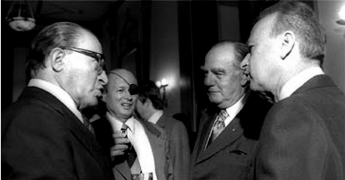
Menachem Begin, Moshe Dayan and Yitzhak Rabin visiting with South African Prime Minister B.J. Vorster (third from the left) in Jerusalem in 1976.