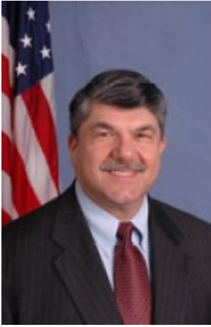
Richard L. Trumka