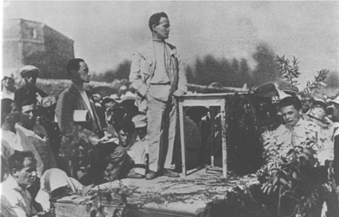
David Ben-Gurion addresses Histadrut members in 1924.

Ben-Gurion made it clear that there was no reason to respect Palestinian rights and that it was also clear that the Palestinians, understandably, would not give up their land without a fight.