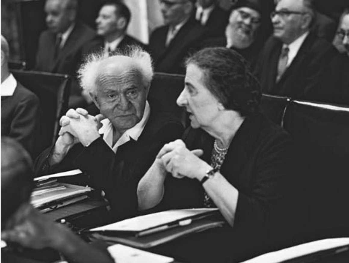
David Ben-Gurion and Golda Meir at the Knesset in Jerusalem in 1962.