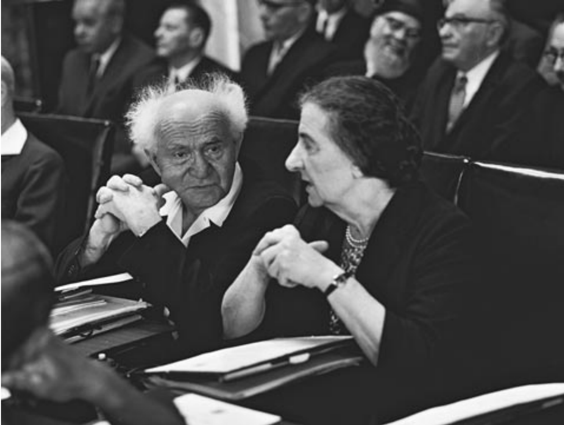
David Ben-Gurion and Golda Meir at the Knesset in Jerusalem in 1962.