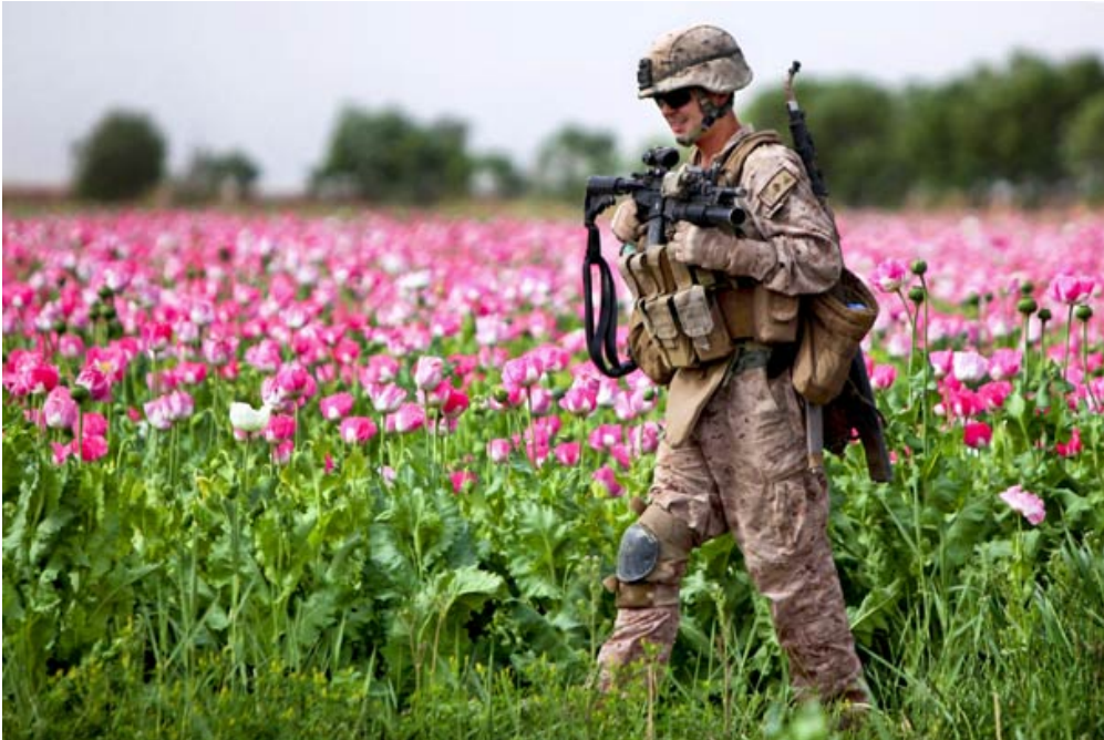
A US Marine patrols through a poppy field in Helmand province, Afghanistan

Bear in mind that SIGAR only covers reconstruction costs, not appropriations for bombs, arms, planes or other military equipment, vehicles or weaponry.