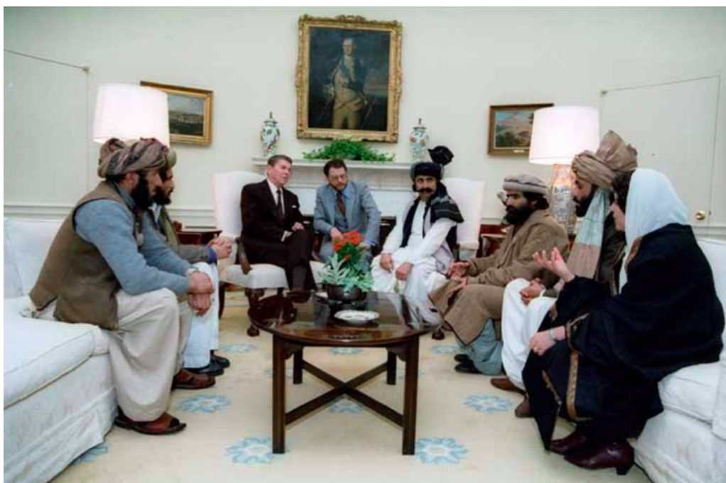
Ronald Reagan meets Afghan Mujahideen Commanders at the White House in 1985

Despite these graphic reports, President Reagan continued to refer to the mujahedeen as "freedom fighters" and in 1985 he invited a group of them to Washington where he entertained them in the Whitehouse. Afterwards, while introducing them to the media, he stated , "These gentlemen are the moral equivalents of America's founding fathers."