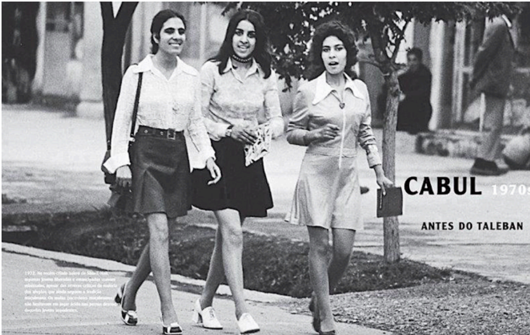
Women at university in Afghanistan in the late 1970s.

“Every girl could go to high school and university. We could go where we wanted and wear what we liked ... We used to go to cafes and the cinema to see the latest Indian films on a Friday ... it all started to go wrong when the mujahedin started winning ... these were the people the West supported.”