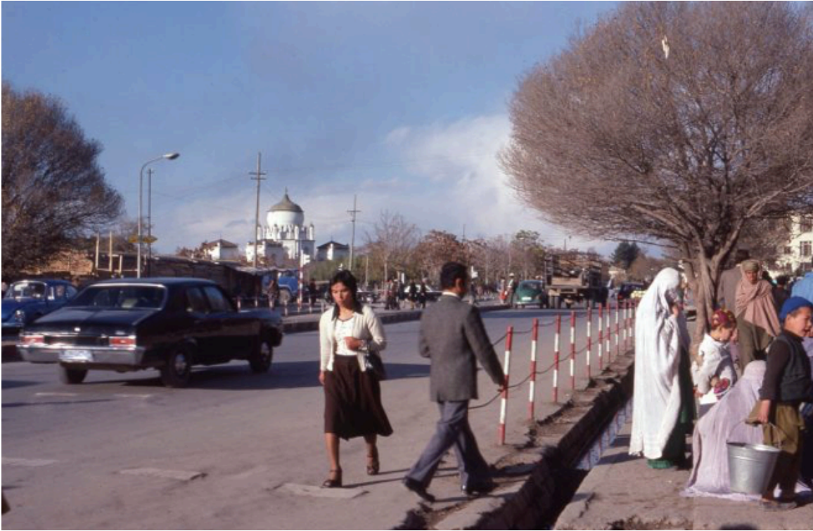
Street scene in Kabul, November 1978. During the Marxist Taraki period, women were free to dress as they wished with no restrictions.

The new government was faced with a variety of major problems . In the 1970s, life expectancy was 35; 1-in-3 children died in infancy, the highest in the world. Ninety percent of the population was illiterate. These were issues that the new government was determined to deal with.