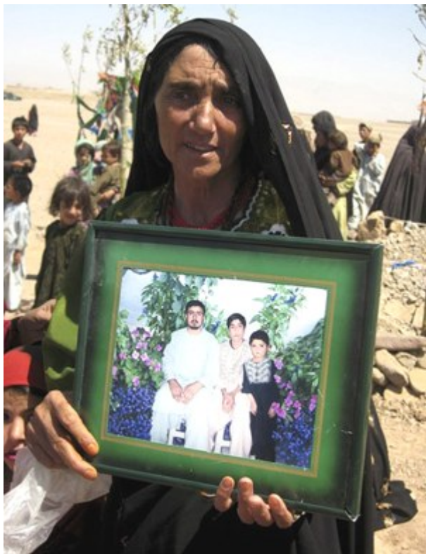
Figure 2. An Afghan woman holds a photo of her family members who were killed on August 22, 2008, in a U.S. air raid called-in by U.S. Special Forces. The U.S. military for weeks denied civilians had been killed

killed by IED's or suicide bombers ("good" bodies). Photos of civilians whose death was caused by U.S. or NATO bombs are virtually non-existent. (20) One might call this censorship by omission. (21) News-magazine photo coverage of the "war on terrorism" in Afghanistan most often supports U.S. government narrative and versions of events. (22) The policy of embedding reporters with U.S. or NATO occupation forces is an obvious attempt at removing independent reporting which, sadly, most often succeeds.