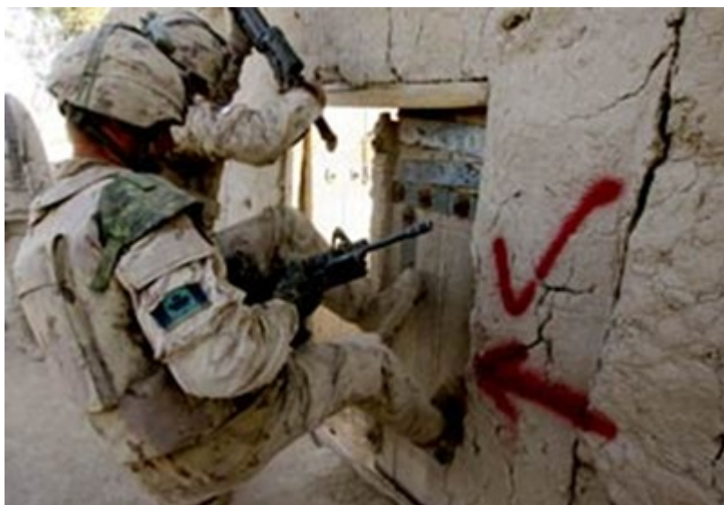
Figure 5. Canadian occupation forces kick down a door in the village of Pashmul, south west of Kandahar in September 2006