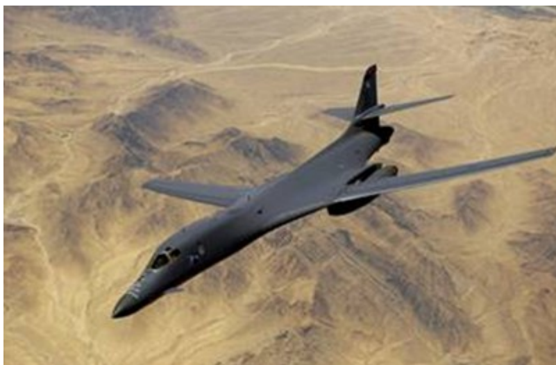
A U.S. Air Force B1-B Lancer bomber after refueling over Afghanistan.

These seven points form part of an interconnected whole - the undervaluation of Afghan lives - supported by many other indicators, e.g. only one dollar is officially spent in "reconstruction" for every ten dollars spent on achieving U.S. geo-political aims.