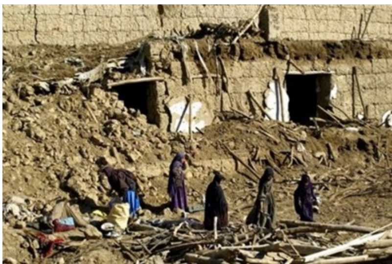
Figure 3. Afghan village women walk in the debris of one of the homes which was bombed by a NATO air strike on Jabar village in the Nijrab district of Kapisa province, north of Kabul, Afghanistan Monday, March 5, 2007. A NATO air strike destroyed a mud-brick home, killing nine people from four generations of an Afghan family during a clash between Western troops and militants, Afghan officials and relatives said Monday

Yes, unfortunately all nine members from four generations of a single Afghan family.