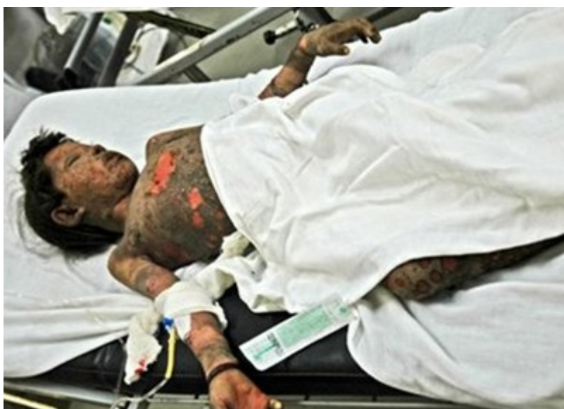
The real face of the U.S.'s Afghan air war: children burnt by U.S. bombs at Lashkargah's Emergency hospital in October 2006. My original dossier on civilian victims of U.S. aerial bombing was released on December 10, 2001, see http://www.cursor.org/stories/civilian_deaths.htm