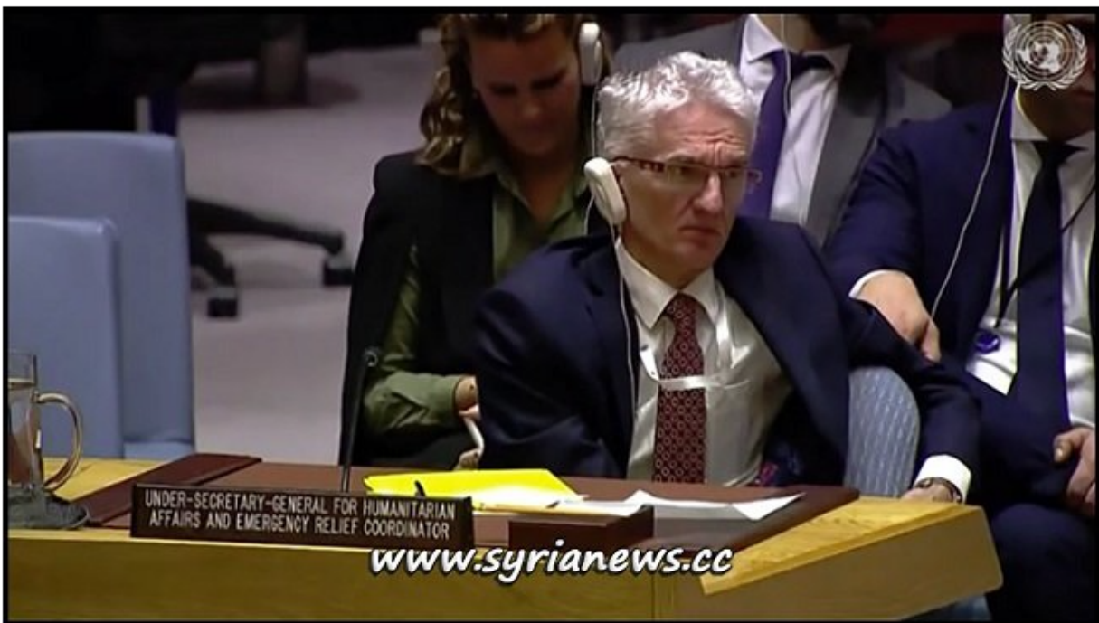
Lowcock averts his gaze from documentation held by H.E. Jaafari. [Archive]

Addressing Mark Lowcock's "falsified" stats at UNSC, Ambassador Jaafari shows documentation for SARC convoys in 2018. [Archive]