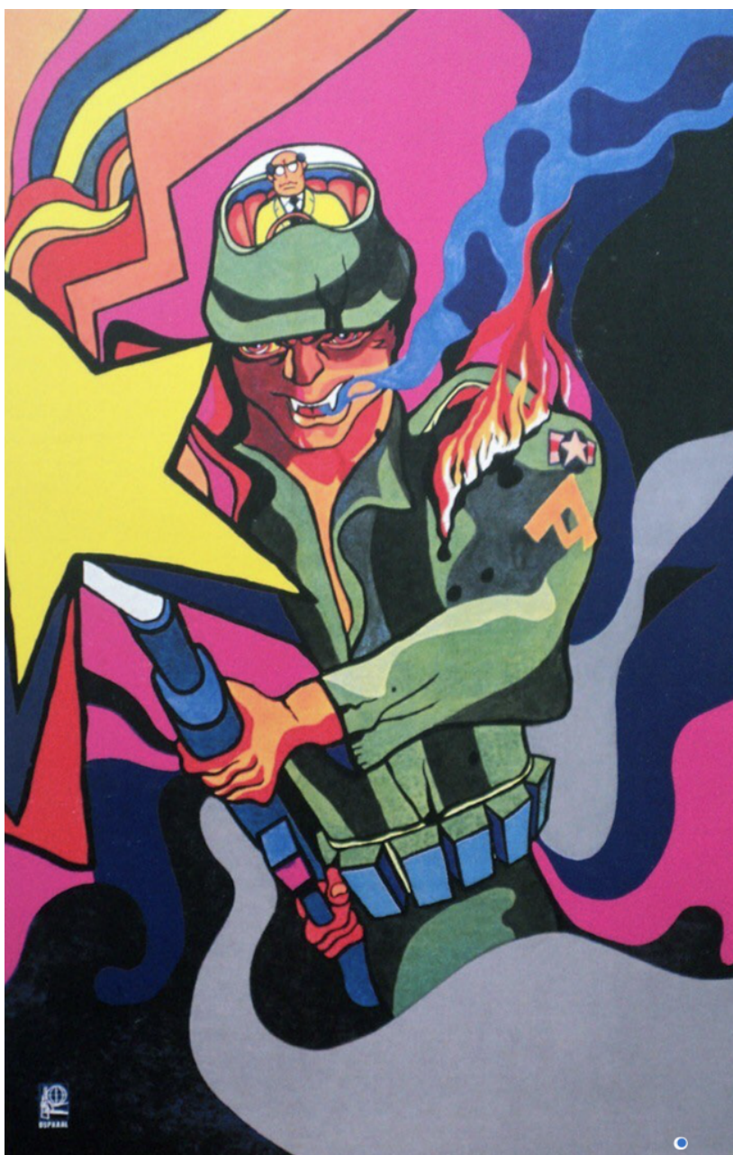
Alfredo Rostgaard, OSPAAAL poster, 1969.

Step Nine: Who Controls the Narrative? The monopoly corporate media takes its orders from the elite. There is no sympathy for the structural crisis faced by governments from Afghanistan to Venezuela. Those leaders who cave to Western pressure are given a free pass by the media. As long as they conduct 'reforms', they are safe. Those countries that argue against the 'reforms' are vulnerable to being attacked. Their leaders become 'dictators', their people hostages. A contested election in Bangladesh or in the Democratic Republic of Congo or in the United States is not cause for regime change. That special treatment is left for Venezuela.