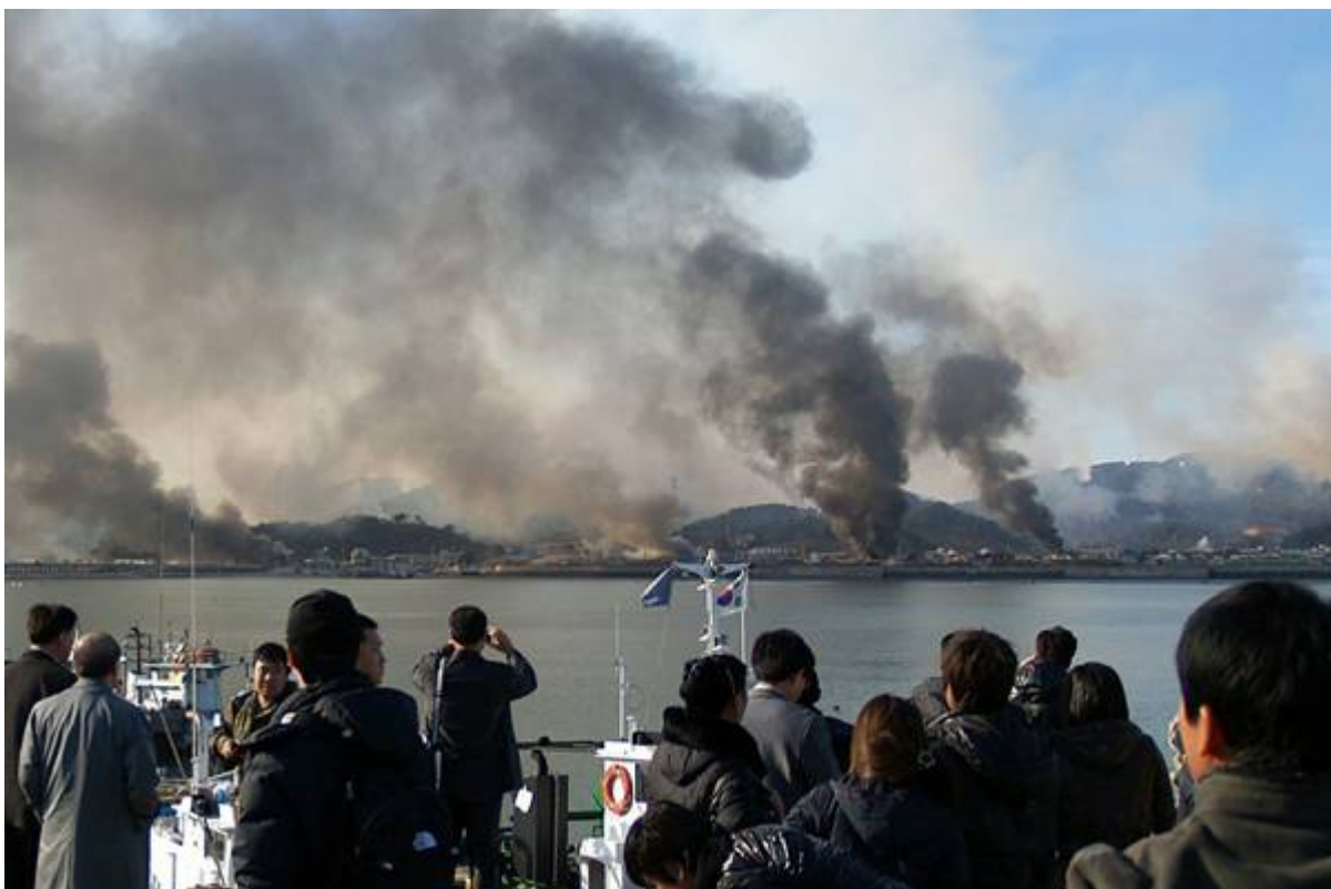
Fig3: Smoke from rocket fire over Yeonpyeong island

To say that the marine artillery drills had nothing to do with the Hoguk exercise seems to be a sophism. Moreover, the warnings stretched further back. The information available on the English-language KCNA website is only a portion of the published Korean-language material, and on top of that there are the direct communications between North and South (such as the telegram mentioned above). However, there is enough English-language for us to get a certain picture of preceding events, even though often the English translation is of poor quality.'