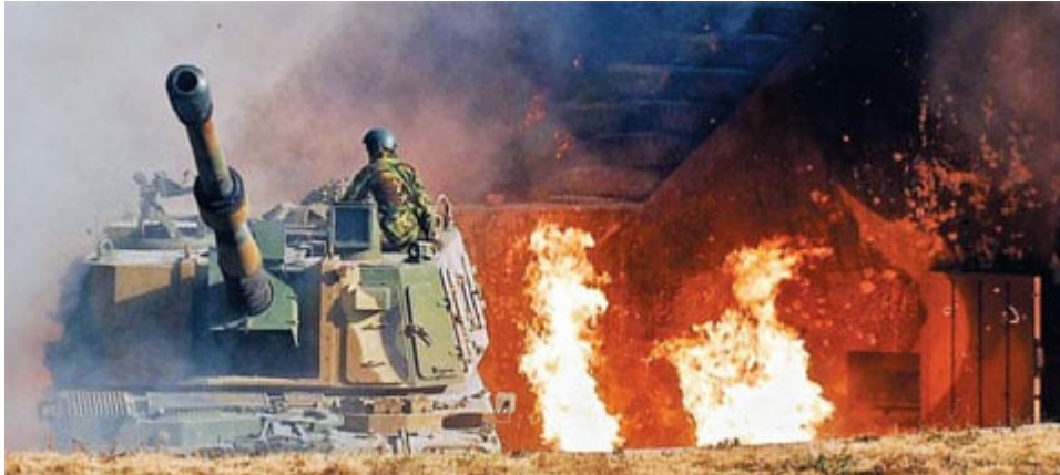
Fig 4: Damage at the marine base

A K-9 Marine artillery base on Yeonpyeong Island under attack by North Korea on Tuesday [“N.Korean Shelling ‘Aimed for Maximum Damage to Lives, Property’.” Chosun Ilbo, 26 November 2010.