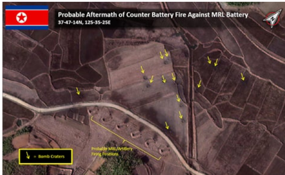
Fig 5: Evidence of inaccurate fire

In this satellite photo released by the U.S. private intelligence agency Stratfor, rice paddies and fields in North Korea bear traces of South Korean artillery shells ["Spies Intercepted Plans for Yeonpyeong Attack in August ". Chosun Ilbo, 2 December 2010.