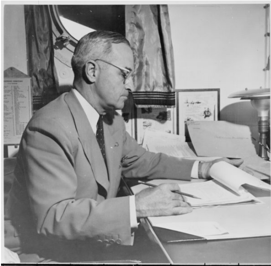
Image on the right: “President Harry S. Truman at his desk aboard the U. S. S. Augusta, returning from the Potsdam Conference. He is preparing his “report to the nation.” August 6, 1945.”

So, while many hands were no doubt involved, we can say with some reliability that Truman was very involved in the drafting process. How involved is a hard thing to say — but it gives us something to think about when looking at the specific language used, to question how much of it reflects the President’s own thoughts (something we cannot do with the original Hiroshima press release, which was written without Truman’s input).