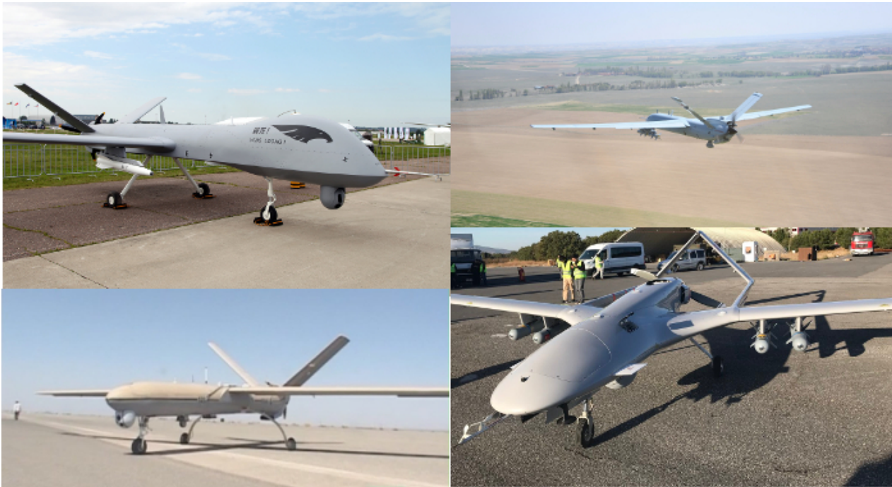
Clockwise from top left: Chinese Wing Loong, Turkey's Anka and Bayraktar, Iranian Shahed 129

option for dealing with internally armed groups. However, given the US precedent of using drones for targeted killings, this raises questions about whether the spread of drones will help or hinder the rule of law in this area. Other countries have used their armed drones in extraterritorial conflict, such as Saudi Arabia, UAE and Iran, and UAE, Egypt and possibly Iran and others in Syria.