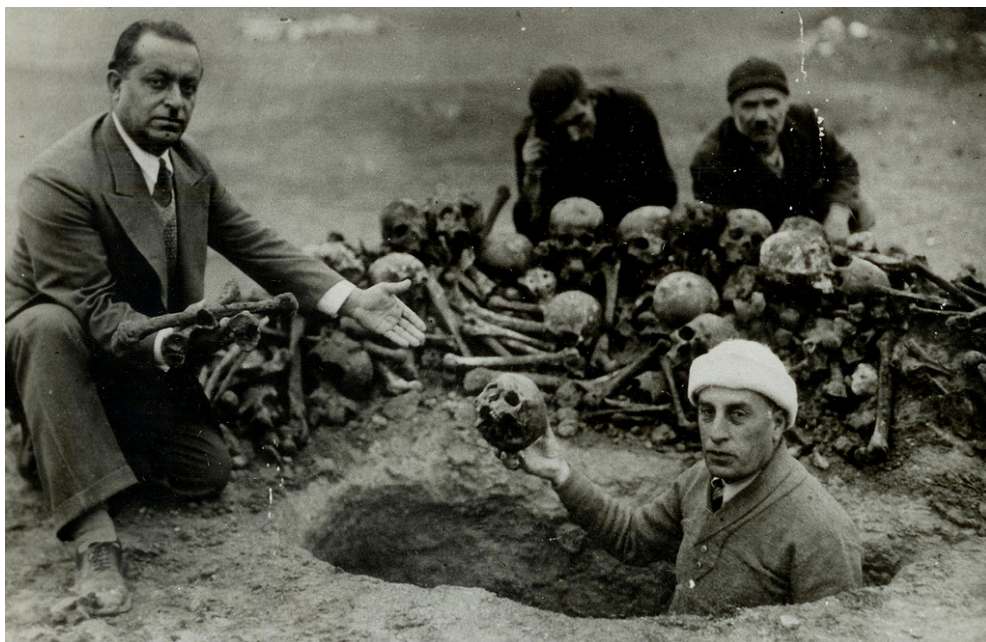
A group of men excavate the remains of victims of the Armenian genocide in modern day, Deir ez-Zor, Syria, 1938.

Much of what the Kurds claim as their own unique culture is actually borrowed from older cultures, such as the Assyrians, Armenians and Suryoye. In fact, much if not all of the land in Eastern Turkey that the Kurds claim as their own once belonged to the Armenians. It is hardly surprising, then, that the Kurds assisted in the Turkish genocide of Assyrians and the 1915 genocide of Armenians .