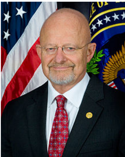
James Clapper, Director of National Intelligence.

We strongly suggest that you ask NSA for any evidence it may have indicating that the results of Russian hacking were given to WikiLeaks. If NSA can produce such evidence, you may wish to order whatever declassification may be needed and then release the evidence. This would go a long way toward allaying suspicions that no evidence exists. If NSA cannot give you that information – and quickly – this would probably mean it does not have any.