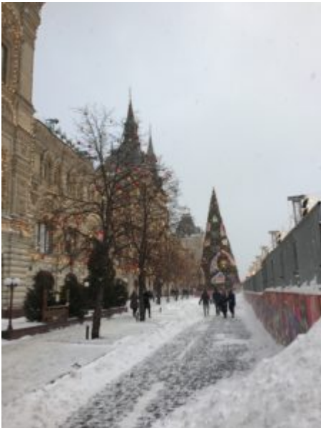
A wintery scene in Moscow, near Red Square.

President-elect Trump said a few days ago that his team will have a “full report on hacking within 90 days.” Whatever the findings of the Trump team turn out to be, they will no doubt be greeted with due skepticism, since Mr. Trump is in no way a disinterested party.