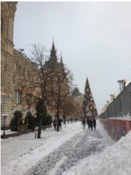
A wintery scene in Moscow, near Red Square.

President-elect Trump said a few days ago that his team will have a “full report on hacking within 90 days.” Whatever the findings of the Trump team turn out to be, they will no doubt be greeted with due skepticism, since Mr. Trump is in no way a disinterested party.