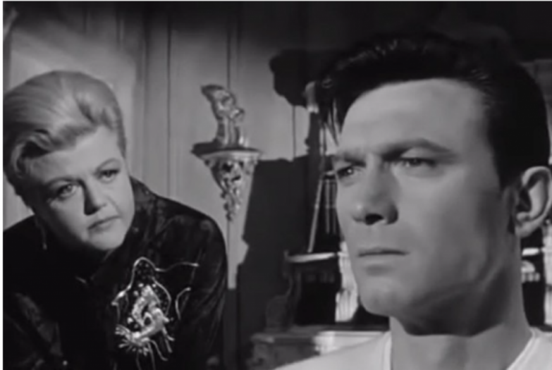
Angela Lansbury and Laurence Harvey in The Manchurian Candidate, in 1962. That movie, and the Richard Condon novel it was drawn from, imagined foreign attempts to direct the outcome of a U.S. presidential election. Yesterday the U.S. government said that Russian hackers have been deliberately trying to change the outcome of this year's race.