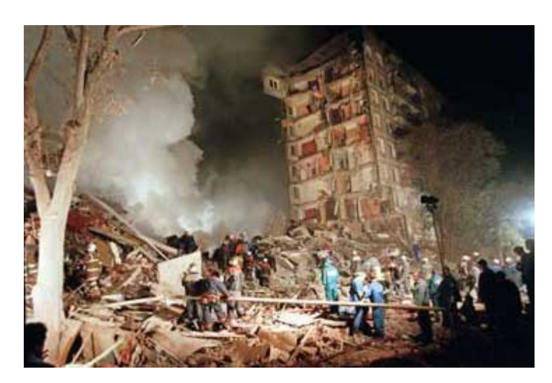
Image on the right: A picture of one of <u>1999 Russian apartment bombings</u>.

(33) An Indonesian government fact-finding team investigated violent riots which occurred in 1998, and determined that "elements of the military had been involved in the riots, some of which were deliberately provoked".