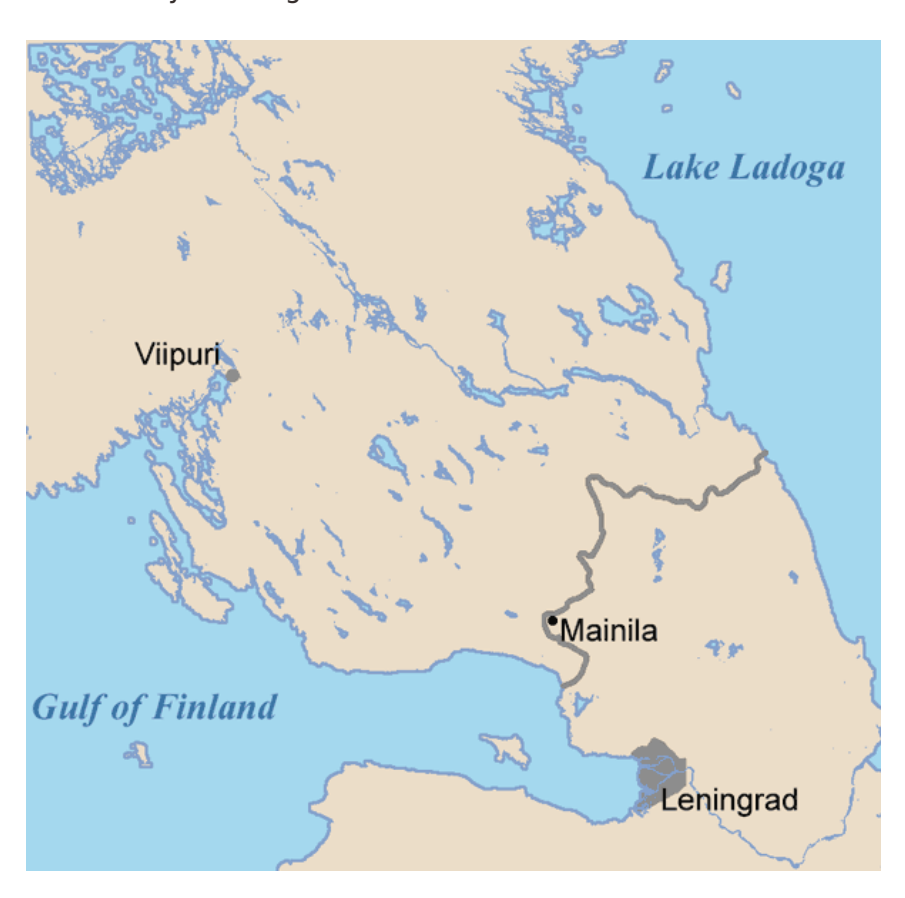
Location of Mainila on the Karelian Isthmus shown in relation to the pre-war Finnish-Soviet border.