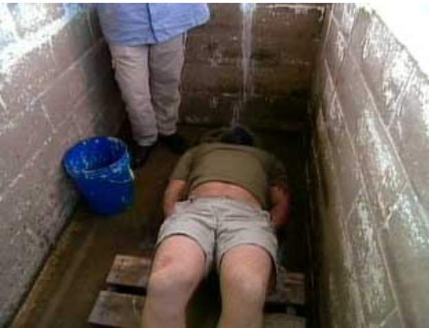
Water-boarding then and now