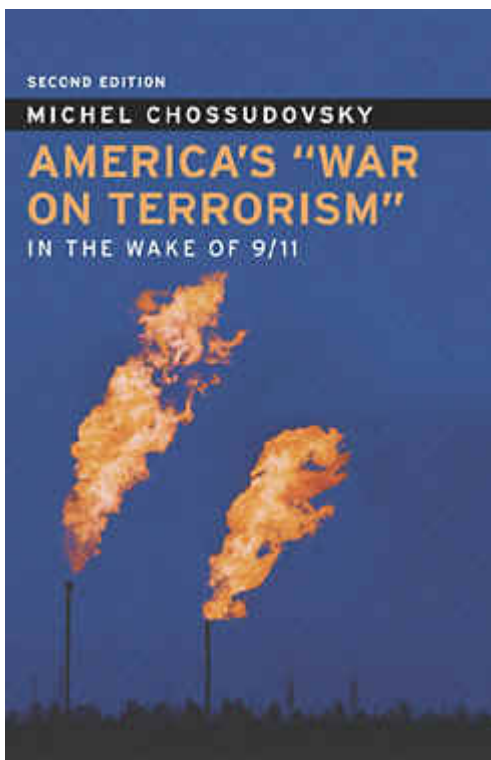
AMERICA'S "WAR ON TERRORISM"

Historically, Pakistan has played a central role in "war on terrorism". Pakistan constitutes from Washington's standpoint a geopolitical hub. It borders onto Afghanistan and Iran. It has played a crucial role in the conduct of US and allied military operations in Afghanistan as well as in the context of the Pentagon's war plans in relation to Iran.