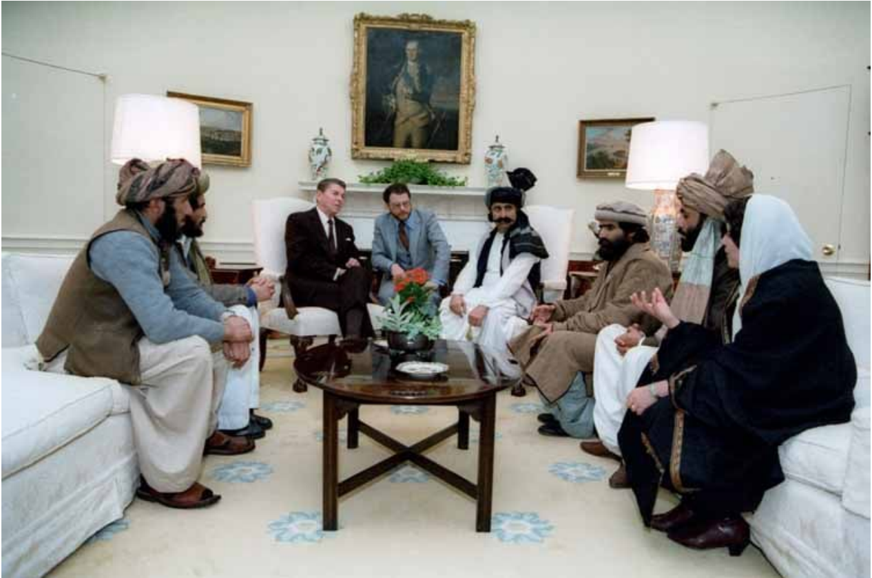
Ronald Reagan meets Afghan Mujahideen Commanders at the White House in 1985

With William Casey as director of the CIA, NSDD 166 was described as the largest covert operation in US history: