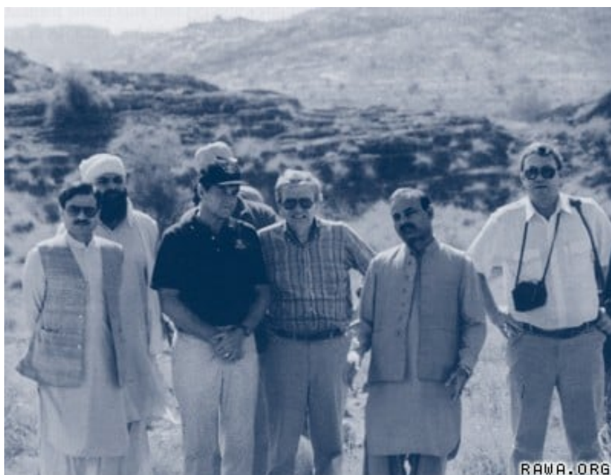
Front row, from left: Major Gen. Hamid Gul, director general of Pakistan’s