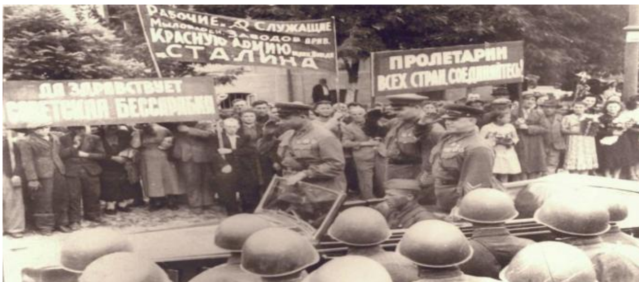
Soviet parade after liberation from Nazi rule in North Bessarabia in Romania.

proceed similarly in countries in Eastern Europe that were destined to be liberated by the Red Army. However, this symmetry was far from perfect. First, until the summer of 1944 the Soviets continued to fight almost exclusively in their own country. It was only in the fall of that same year that they liberated neighbouring countries such as Romania and Bulgaria, states which could hardly rival Italy and France.