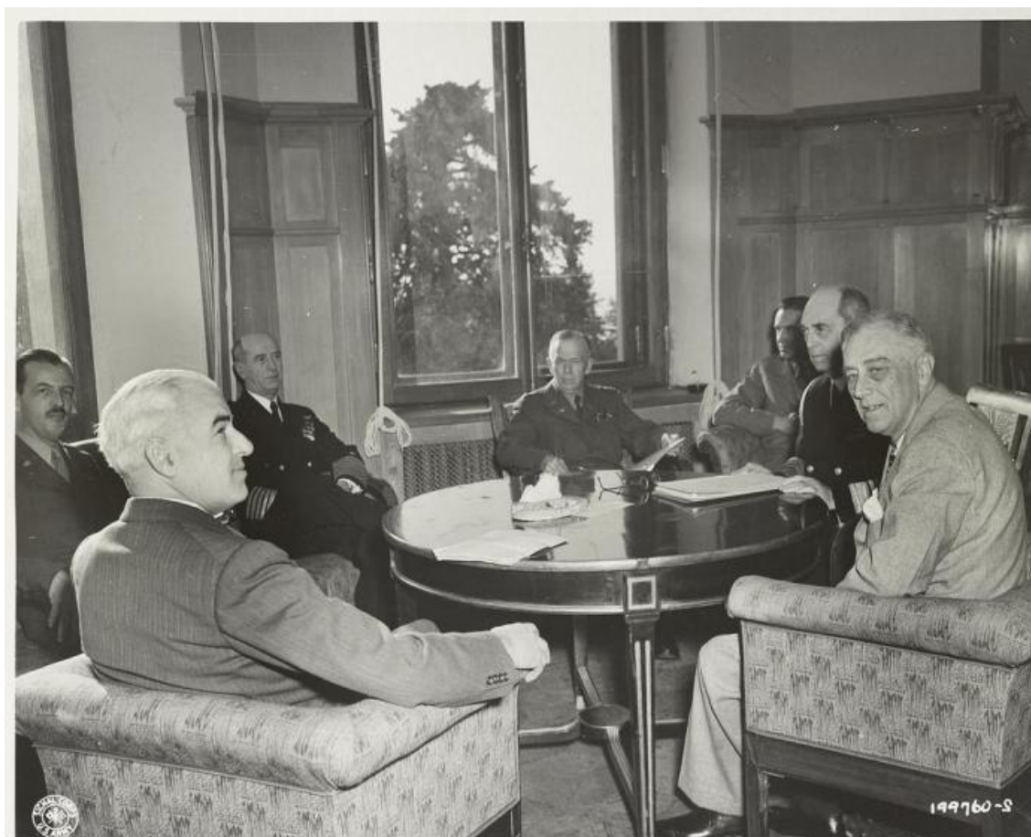
Yalta American Delegation in Livadia Palace from left to right: Secretary of State Edward Stettinius, Maj.

Conversely, to obtain the Soviet leader’s ratification of Germany’s division into occupation zones and his acceptance of other arrangements that were advantageous to themselves, the Americans and the British also indulged Stalin in some respects. In return for Stalin’s renewed commitment to eventually declare war on Japan, for example, Roosevelt offered American assent to the Soviet recuperation of the Far Eastern territories that czarist Russia had lost as a result of the Russian-Japanese War of 1904-05. [12]