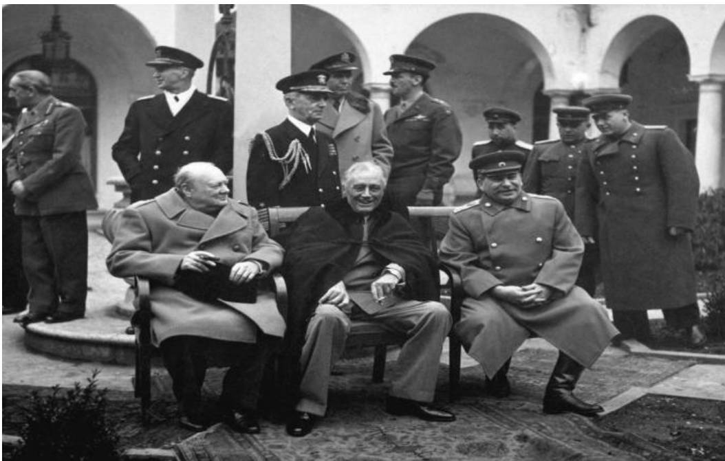
Famous photograph of Big 3 at Yalta—Winston Churchill, Franklin D. Roosevelt and Joseph Stalin.