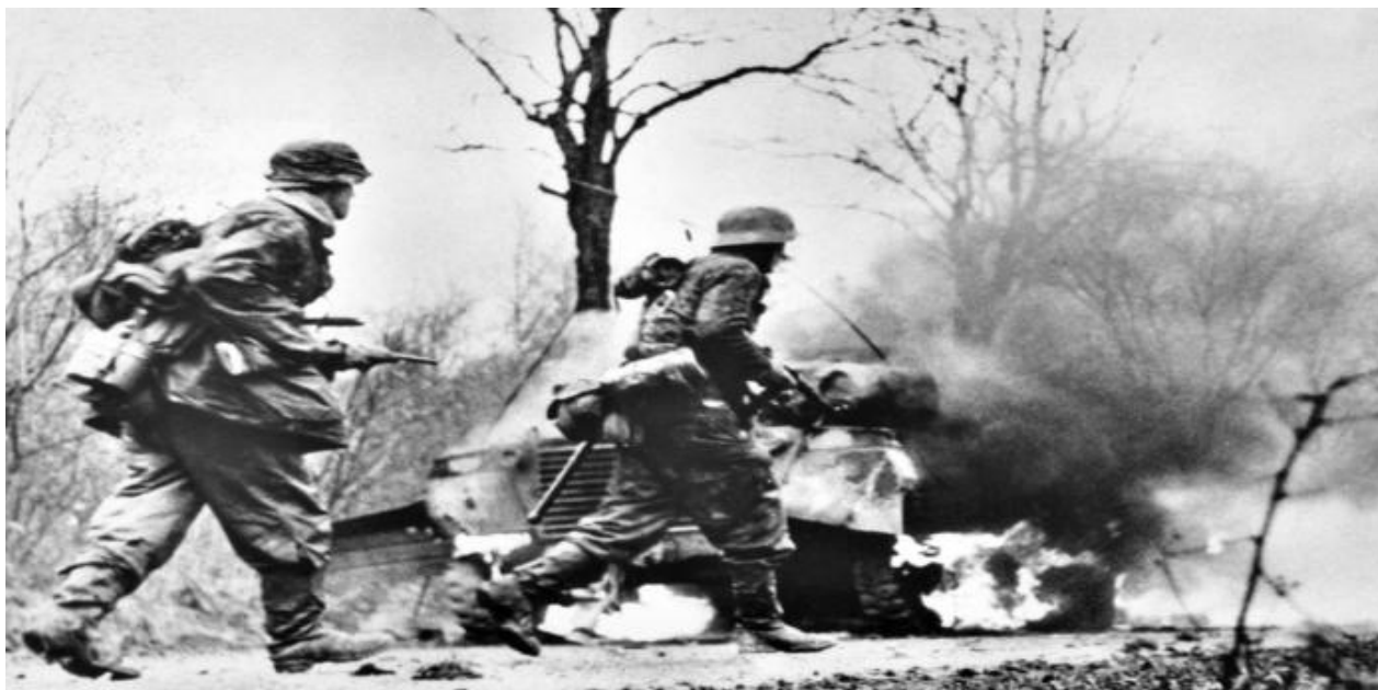
Scene from the Battle of the Bulge.

celebrated in due course in an eponymous Hollywood production. In reality, however, the confrontation in the Ardennes represented a serious setback for the Americans. Von Rundstedt's counteroffensive did eventually end in failure, but initially the German pressure was considerable.