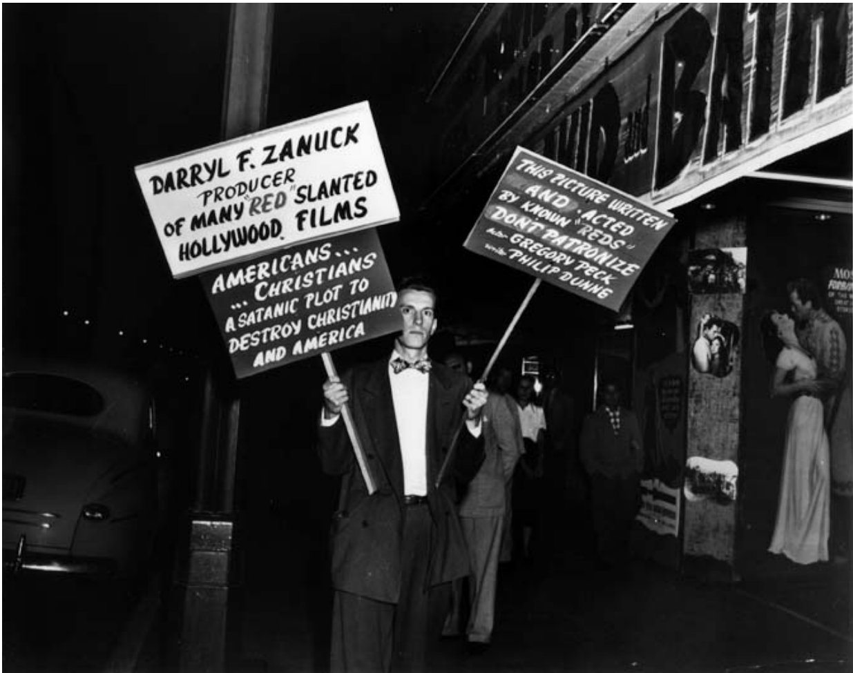
Reds-under-the-beds zealotry of the Blacklist period.

Commemorations of the 75 th anniversary of the Hollywood Blacklist kick off on October 13, 2022, as Turner Classic Movies launched a film series with the premiere of the excellent short, High Noon on the Waterfront . This compelling 14-minute documentary co-written/co-directed by David C. Roberts and Billy Shebar shows how two artists ensnared in the Blacklist metaphorically expressed their stands regarding the motion picture purge through their films.