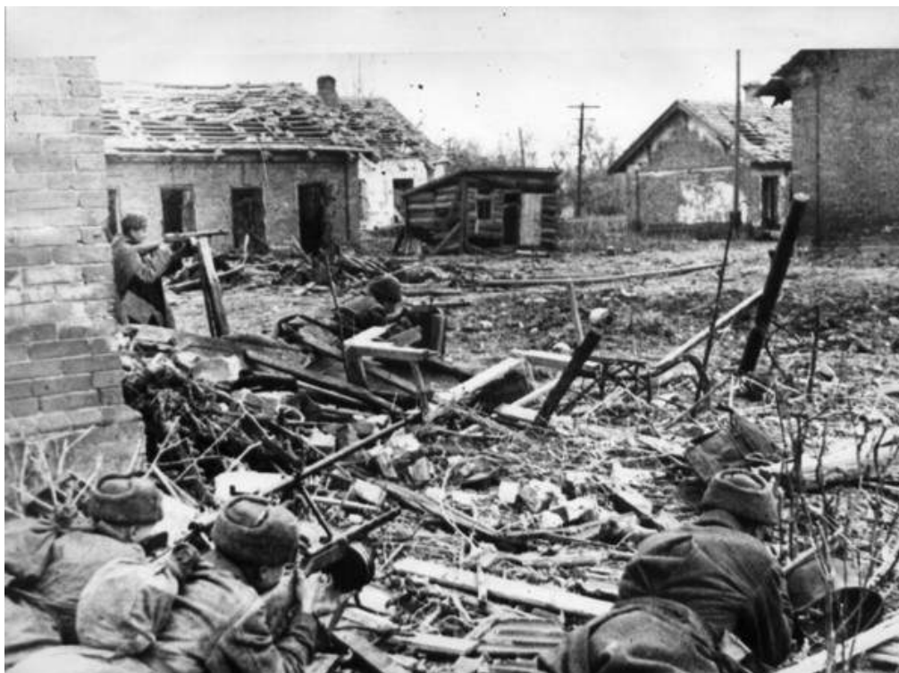
Soviets preparing to ward off a German assault in Stalingrad's suburbs

offensive inevitably petered out, in September of that year, their weakly held lines were stretched along many hundreds of kilometres, presenting a perfect target for a Soviet counterattack. This is the context in which an entire German army was bottled up, and ultimately destroyed, in Stalingrad, in a titanic battle that started in the fall of 1942 and ended in early February 1943, precisely 75 years ago. After this sensational victory of the Red Army, the ineluctability of German defeat in World War II was obvious for all to see; and this – combined with the unprecedented losses suffered by both sides – is what has caused many historians to proclaim this battle as the turning point of the war.