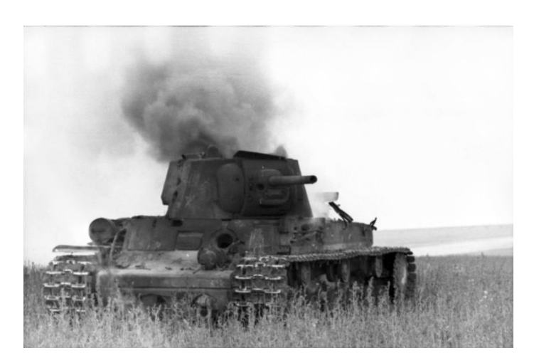
Image below: A Soviet KV-1 heavy tank destroyed near Voronezh (1942)

The day after Rostov's capitulation, 24 July 1942, another major German success was secured with the conclusion of the Battle of Voronezh, near the Don River. The Soviets lost over 550,000 men during the Battle of Voronezh, while the Wehrmacht and their Hungarian allies had less than 100,000 casualties (11). This battle, lasting for almost four weeks, is