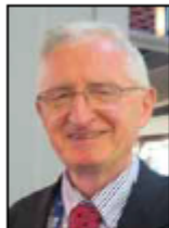
Živadin Jovanović

cc. This year, Serbia joins 119 states in celebrating the 60 th anniversary of the Non-Aligned Movement (NAM).