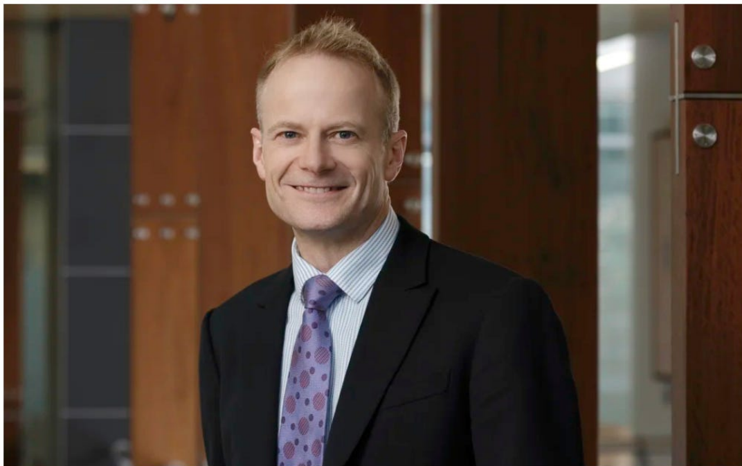
Prof Richard Scolyer

Pathologist professor Richard Scolyer's melanoma research is credited with saving tens of thousands of lives, but now he's in a race to save his own.