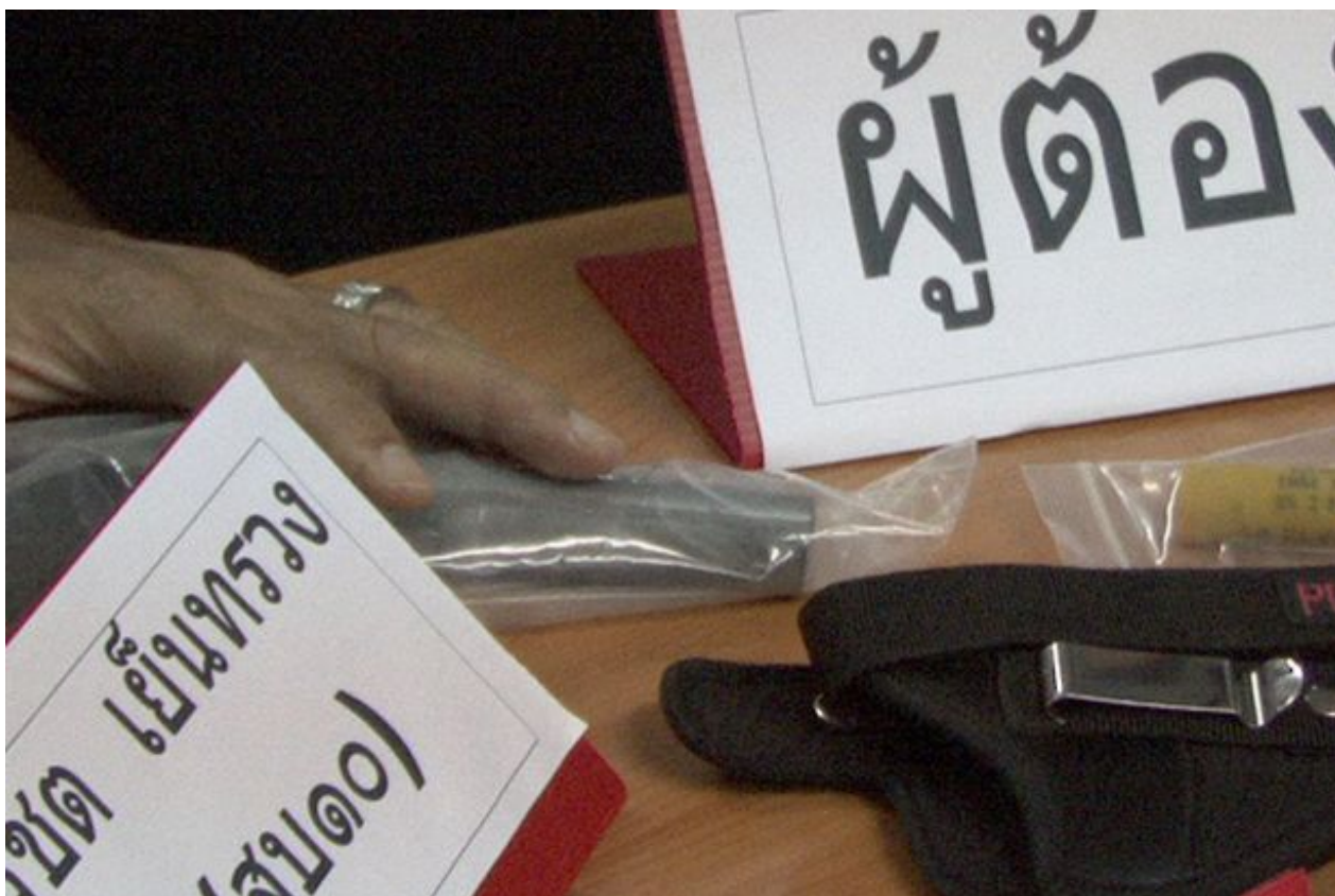
Image: This homemade handgun was made by an unruly Thai party-goer who claimed the life of a British tourist this New Year's Eve. Despite the ubiquitous nature of guns, both homemade and manufactured in Thailand, and nearly no means of enforcing whatever legislation may or may not be on the books, gun violence (and violence overall) is still less than in the United States.

In Thailand, vocational schools are plagued by fierce gang-style rivalries. With standard tools, these students construct homemade guns which they frequently murder each other with. And just this New Year's Eve, a British tourist was killed when a fight broke out at a party, and a homemade gun was fired . The difference between a Thai vocational education, and say a German or Japanese vocational education is one of culture and socioeconomics - not access to tools.