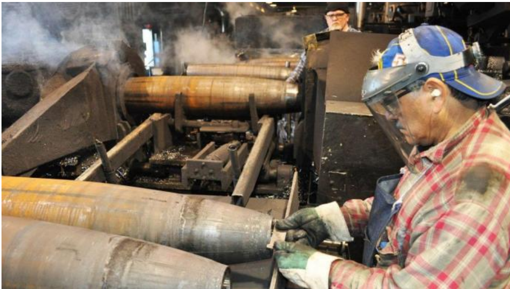
A worker at the General Dynamics Ordnance and Tactical Systems, Inc., plant in Garland, Texas, works on the MK-80 series of bombs.

The bombs include MK-80 bombs made by General Dynamics in Garland, Texas, and retrofitted in McAlester, Oklahoma, at the McAlester Army Ammunition Plant, which produces a wide variety of bombs, including the infamous Massive Ordnance Air Blast (MOAB) bombs dropped on Afghanistan, whose yield is comparable to a tactical nuclear weapon. [3]