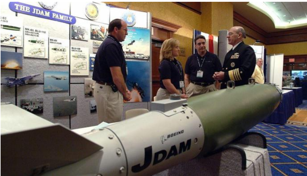
A Joint Direct Attack Munition (JDAM) kit fixed to a bomb on display at the Navy League’s 2003 Sea-Air-Space Exposition.

In December, Amnesty International carried out an investigation , which determined that Joint Direct Attack Munitions (JDAM) manufactured by Boeing at a factory in St. Louis, Missouri, were used by the Israeli military in two unlawful air strikes on homes full of civilians in the Gaza Strip on October 10 and 13, with the fragments from the bombs found in the rubble.