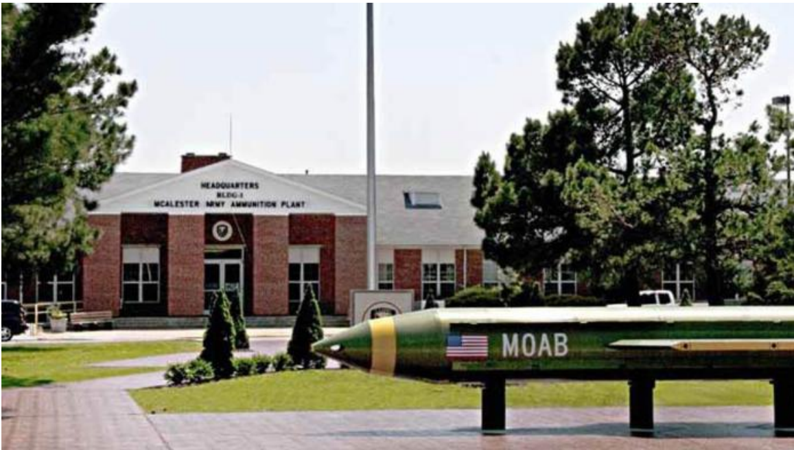
McAlester Army Ammunition Plant where they are proud of their deadly creation.

According to the WSWS , the MK-80 is a “primary bomb being used by the IDF as it destroys Gaza.” The IDF has also likely been using GBU-12 (Paveway) laser-guided bombs manufactured by Lockheed at its plant in Archbald, Pennsylvania, that are dropped from Lockheed F-35 fighter jets manufactured at a Lockheed plant in Fort Worth, Texas.