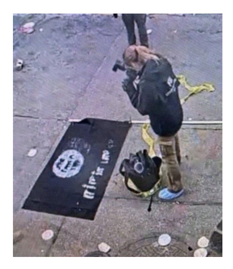
FBI agent examining the Islamic State flag that was displayed on suspect's car. (Licensed under Fair Use)