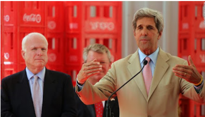
Photo: McCain (left) and Kerry (right) gesticulate as they explain their paymaster's agenda within the confines of an Egyptian Coca-Cola factory. This is part of their latest trip surveying the effects of their US-funded opposition overthrowing Hosni Mubarak's government.

June, 2011: In " Arab Spring brings Corporate Locust ," the true agenda behind Egypt's, and indeed the entire "Arab Spring's" unrest became apparent as US representatives gave Fortune 500 executives a tour of destabilized Egypt and Tunisia in an effort to promote economic liberalization and privatization. John McCain and John Kerry led the tour and had co-sponsored bills to promote what would essentially be the meshing of Egypt and Tunisia's economy into the Wall Street/London international order.