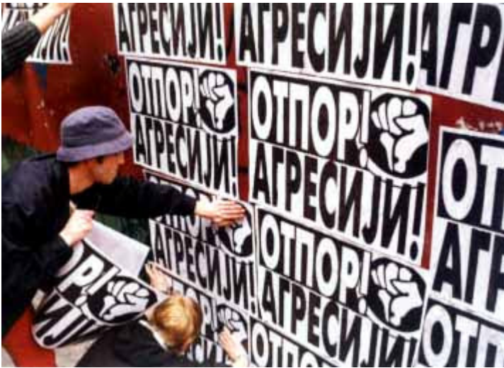
Photo: Serbia's "Otpor," a model for future US-backed color revolutions.