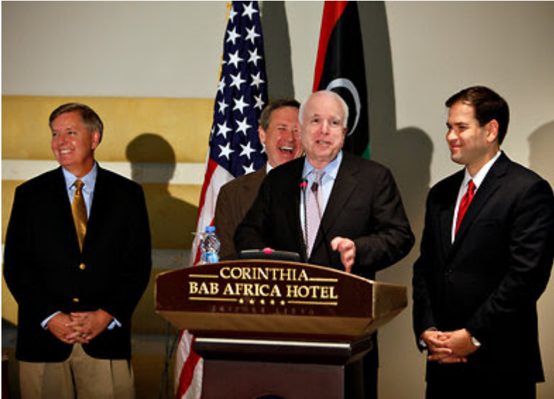
Photo: It's all smiles and laughs in Tripoli as McCain, a chief proponent and driving force behind the US intervention in Libya, literally glorifies Al Qaeda's exploits in the now ruined nation. Miles away, the very rebels he was praising are purposefully starving the civilian population of Sirte in an effort to break their will, while they and NATO indiscriminately use heavy weapons aimed at crowded city centers.