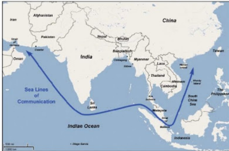
Image: The “String of Pearls:” China’s oil lifeline is to be cut by the destabilization and regimes changes being made throughout Africa and the Middle East. Along the “String” the US has been destabilizing nations from Pakistan to Myanmar, from Malaysia to Thailand, to disrupt and contain China’s emergence as a regional power.