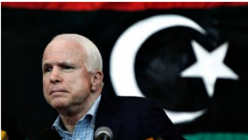
Photo: Ultimate act of treason: McCain calls for recognition and extra-legal support for the very men who had killed US troops in Iraq and Afghanistan. By denying "Al-Qaeda" a base in Iraq, but handing them the entire nation of Libya, he has brought American foreign policy to a new level of surrealism.

April 22, 2011: John McCain touches down in Benghazi, Libya and consorts with verified terrorists who were fresh back from Iraq and Afghanistan, killing US troops. A West Point report would later confirm (.pdf from West Point's CTC can be found here ) with absolute certainty that the region from which the Libyan rebellion began was also the Libyan Islamic Fighting Group's (LIFG) center of operations. It would also expose the fact that LIFG were in fact long-time affiliates of Al Qaeda with LIFG members occupying the highest levels of leadership within the terrorist organization.