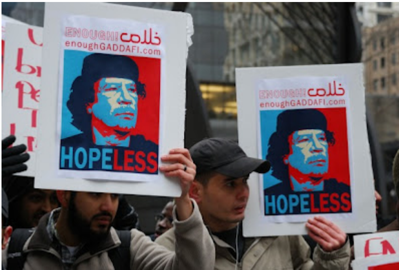
Photo: Please note the “EnoughGaddafi.com” signs. EnoughGaddafi.com’s webmaster is listed on the US State Department’s Movements.org as the “Twitter” to follow.