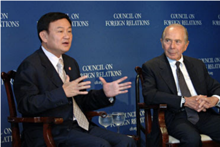
Photo: Thaksin Shinawatra, a long time servant of the global elite, since before even becoming Thailand's prime minister in 2001, reports to the CFR in New York City on the eve of the 2006 military coup that ousted him from power. He has now returned to power in Thailand via a proxy political party led by his own sister, Yingluck Shinawatra. Securing the votes of only 35% of eligible voters puts on full display how tenuous his support really is within a nation he claims stands entirely behind him.