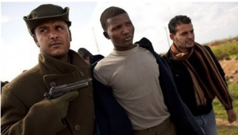
Photo: Libya's rebels are far from motivated by democratic aspirations. Their grievances lie along ethnic, not political divides. "Gaddafi supporters" is the euphemism being used by the global corporate-media in describing the generally darker skinned and African tribes and who are bearing the brunt of

By late August, NATO began a coordinated attack on Tripoli, Libya, involving an elaborate psychological-operation that claimed to have eliminated or captured the entire Qaddafi family in a single day. The following day, Saif Al-Qaddafi would turn up alive and well, and free, while leading fierce fighting that would carry on until October and result in NATO leveling the cities of Bani Walid and Sirte in particular, into piles of rubble. It had become entirely clear that NATO was providing air support not for democracy-loving freedom fighters, but for hardcore terrorists who were carrying out a systematic campaign of genocide and reprisals throughout the country.