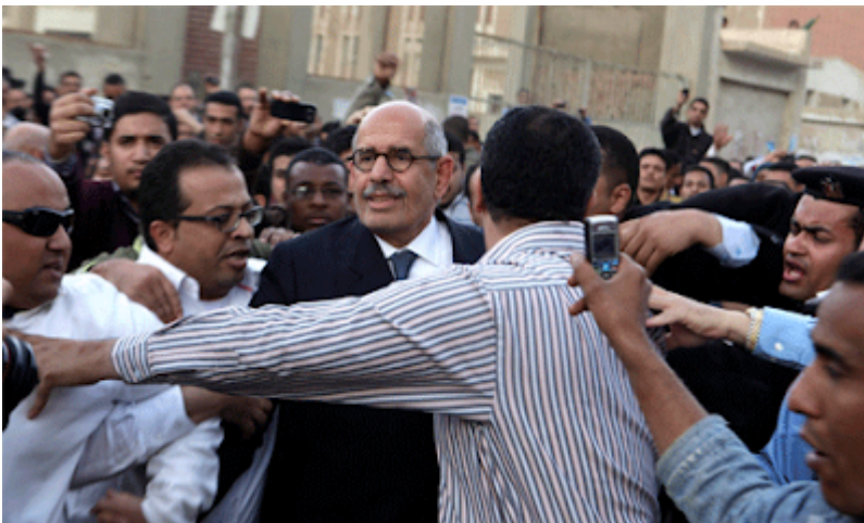
Photo: The “barrier of legitimacy” is broken: a mob shouts “American agent”

March 26, 2011: In Egypt, signs of a counterrevolution and the first signs of weakness in ElBaradei’s chances to be installed as president began to show. Mobs pelted ElBaradei with rocks calling him “ an American agent .” Wikileaks would again come to the aid of US interests and try to reintroduce the “anti-Western” image ElBaradei had been hamfisted in portraying.