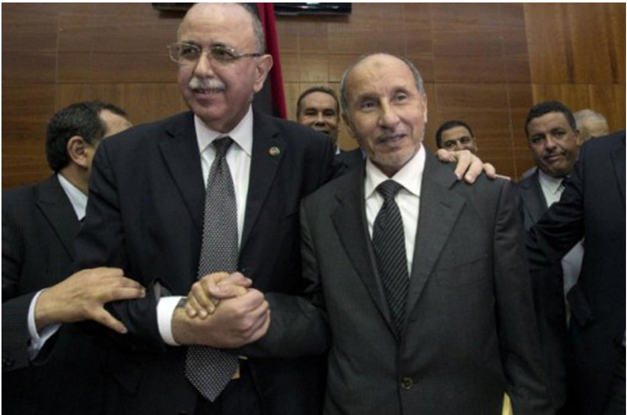
Photo: And so begins the farce that is Western “democracy.” One corporate puppet Mahmoud Jibril , steps down, another, Abdurrahim el-Keib, takes his place. In reality, it is NATO-states and their corporate sponsors that now determine Libya’s fate. Pictured above, el-Keib poses with Mustafa Abdul-Jalil, chairman of the unelected, NATO-backed “National Transitional Council.”

Also in November, Wall Street and London’s assault on Libya came full circle with the installation of Abdurrahim el-Keib as prime minister. El-Keib who spent decades in exile in the US, was formally employed by the Petroleum Institute, based in Abu Dhabi, UAE and sponsored by British Petroleum (BP), Shell, France’s Total, the Japan Oil Development Company, and the Abu Dhabi National Oil Company.