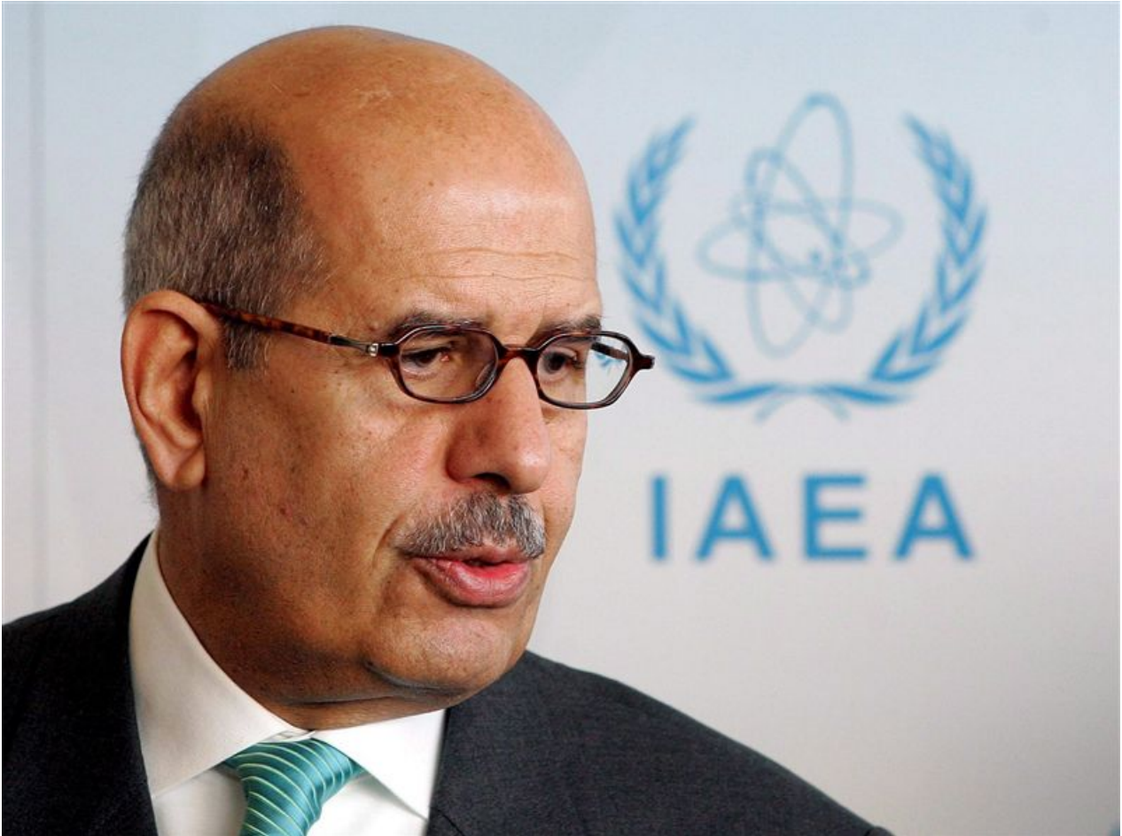
Photo: ElBaradei's ties to the West go much deeper than merely play-acting within the ineffectual, genocide-enabling UN. He is also a member of the corporate-financier funded International Crisis Group.