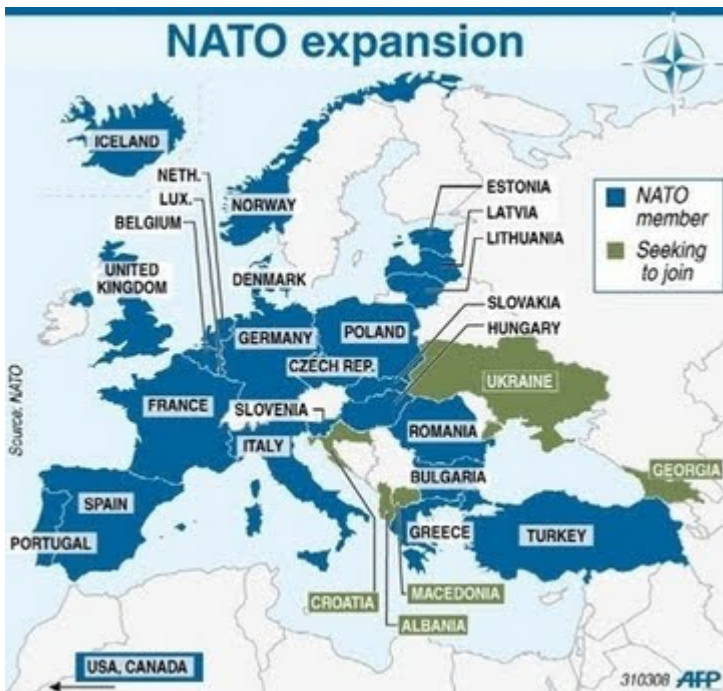
Image: NATO’s creeping encirclement of Russia has now been combined with another round of “color revolution” destabilizations in Belarus and now in Russia itself.

Meanwhile in Russia, Wall Street and London attacked more directly, attempting to interfere with Russian elections in December and resulting in several street protests led by overtly linked NED, Soros, and Rothschild operatives . NED-funded NGO “Golos” played a key role in portraying the elections as “rigged” and constituted America’s extraterritorial meddling in Russia’s sovereign affairs.