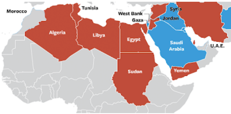
Image: Red = US-backed destabilization, Blue = US occupying/stationed. China's oil and sea access to the Middle East and Africa are being or have already been cut. A similar strategy of isolation was used on Japan just before the onset of World War II.